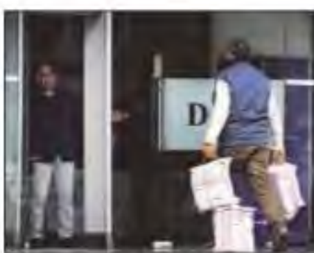
Chief Secys, Census officers of states minus Bengal came for meeting.