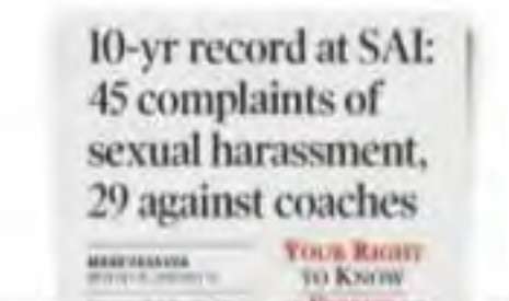
The Indian Express report on January 16

"The inquiries that are underway will be speeded up. I have