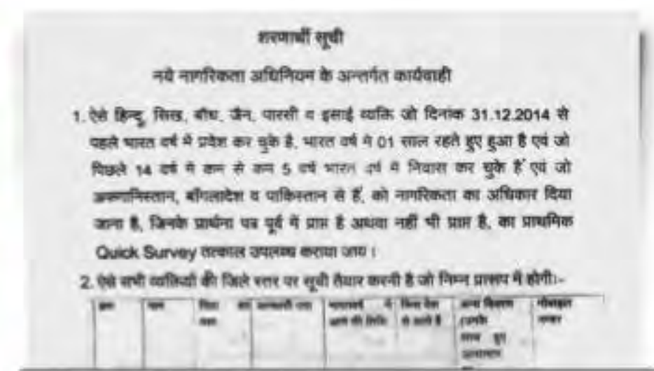
The form sent to all District Magistrates in UP