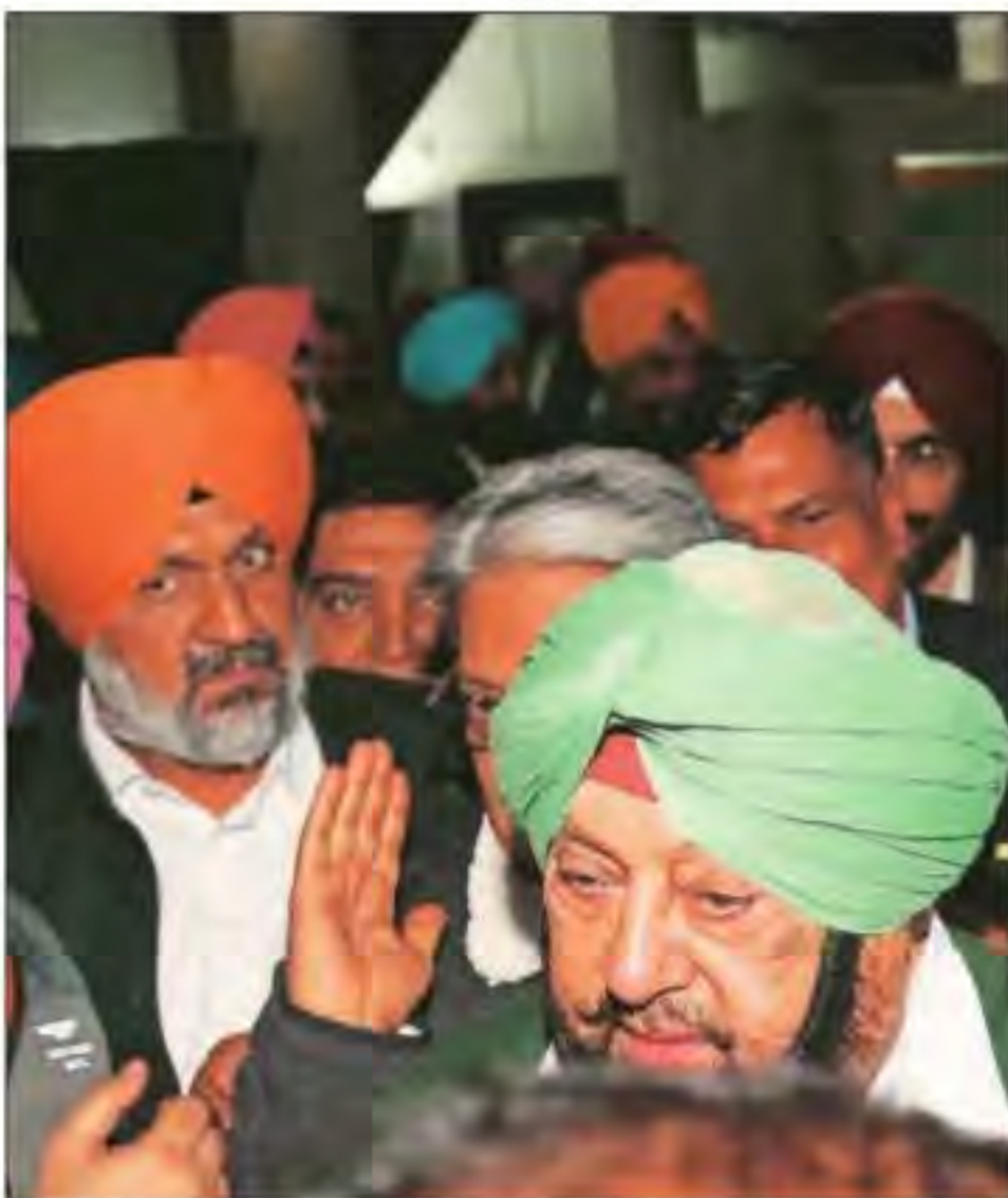
Chief Minister Amarinder Singh at the Punjab Assembly on Friday in Chandigarh.