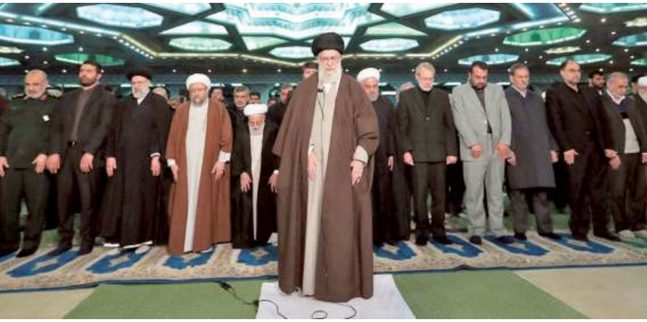
Honouring a soldier: Iran's leader Ayatollah Ali Khamenei leading Friday prayers in Tehran.

His sermon came after a traumatic month for Iran in which the country had appeared on the brink of war with the United States before mistakenly shooting down the Ukrainian jet with the loss of all 176 people on