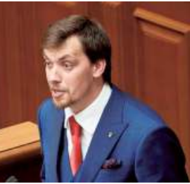
Ukrainian Prime Minister Oleksiy Honcharuk.

Speculation over Mr. Honcharuk's position has grown this week after a recording of a man discussing President Volodymyr Zelenskiy's purported lack of knowledge of economics was circulated on messaging channels, apparently at a meeting of the Prime Minister, Finance Minister and the National Bank of Ukraine in December.