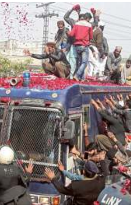
Supporters of Pakistani Islamist group Tehreek-e-Labbaik in Lahore.

The country's Supreme Court overturned her conviction in 2018 but after hard-line Islamists staged nationwide rallies against the ruling, authorities continued to hold her in protective custody before she was allowed to leave for Canada last year to reunite with her