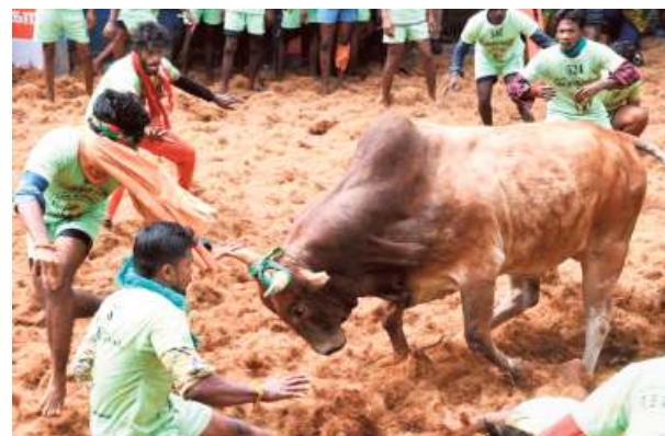
Youth take on a bull at the Alanganallur jallikattu, near Madurai, on Friday.

He was rushed to the Government Rajaji Hospital