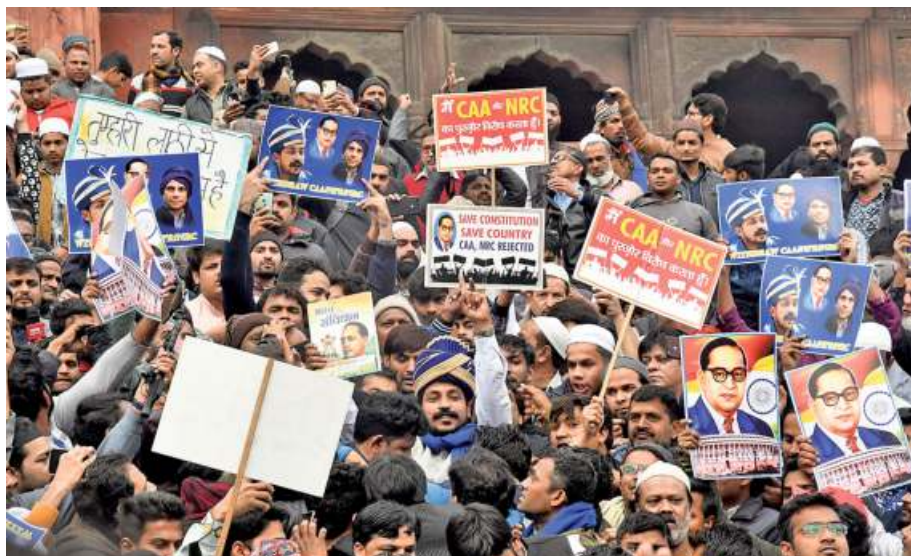
Registering dissent: Bhim Army chief Chandrashekar Azad (in blue turban) with his supporters during a protest at the Jama Masjid in Old Delhi on Friday. (REPORT ON PAGE 2)

Minister of State for Home G. Kishan Reddy said no one