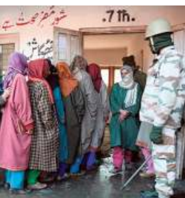
Voters at a booth in Budgam during the 2018 panchayat polls.

Several sarpanches elected from south Kashmir are still living in hotels and government accommodation in Srinagar due to the threat