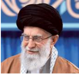
Ayatollah Ali Khamenei

The U.S. carried out the strike in western Iraq in retaliation for rocket fire that