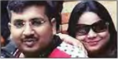
BUSINESSMAN, WIFE, DAUGHTER FOUND DEAD IN VEHICLE PAGE 6