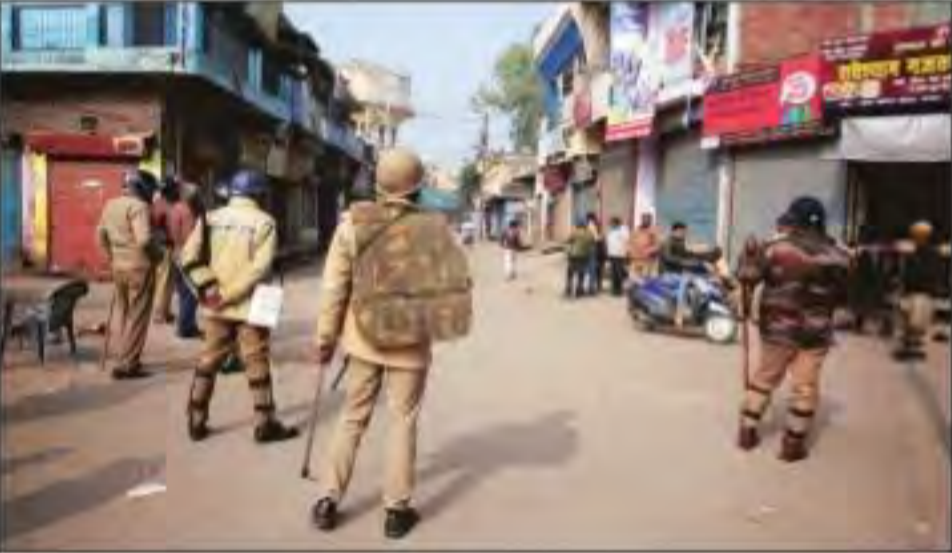
Police personnel in the area where Mohammed Sheroz was killed in Sambhal, Uttar Pradesh. File RELATED REPORTS, P 9

meticulously documented details of the alleged violence, the timeline of events, and slapped seven separate charges under the IPC against 17 named individuals. However, in the latter, the document is devoid of any detail, is completely silent on the murder — and just one section under the IPC has been slapped, records accessed by The Indian Express reveal.