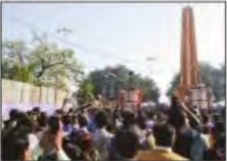
THOUSANDS GATHER AT BHIMA KOREGAON, INTERNET DOWN PAGE 11