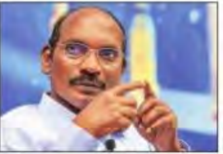
ISRO Chairman K Sivan in Bengaluru, Wednesday.

Chandrayaan-2, launched in July last year, had failed to soft-land its lander and rover modules on the moon. Just a few hundred metres from the lunar surface, the spacecraft had developed problems in the last stages of its descent and was unable to reduce its speed at the required rate. It had crash-