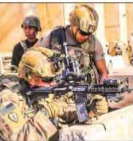
U.S. TROOPS FIRE TEARGAS AS PROTESTERS SWARM EMBASSY IN BAGHDAD PAGE 15