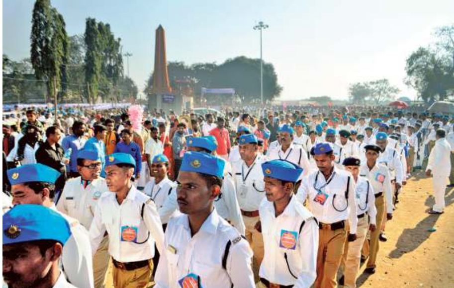
Tight vigil: Security personnel arrive at Ranstambh or victory pillar in Perne on the 202nd anniversary of the historic 1818 battle of Bhima-Koregaon. on Wednesday.

Mr. Ambedkar said, “At the time of the Namantar (name change) movement in 1977-78 to rename Marathwada University in Aurangabad as Dr. Babasaheb Ambedkar University, there were politically engineered riots across the State, with atrocities on Dalits. This was due to the changed political scenario in the State at the time. Similarly, the changed political scenario