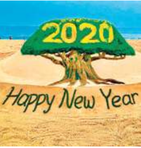
Sudarsan Pattnaik's sculpture.

The sculpture was completed on Tuesday evening and devotees and revellers who have gathered in Puri on the occasion of New