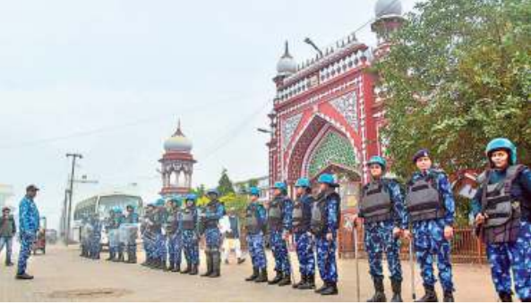
Police personnel stand guard outside the Aligarh Muslim University campus.

The decision was taken at a consultative meeting of the