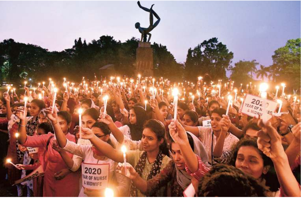
Nursing students celebrating the WHO's announcement of declaring the year 2020 as the 'Year of nurse and midwife' by lighting candles at Mananchira square in Kerala's Kozhikode on Wednesday.