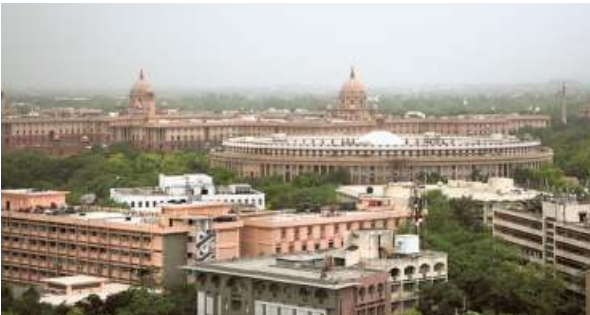
Major revamp: A residential complex near the South Block is also under consideration.

"The complainant, a resident of Delhi, submitted a complaint to the CBI that a clearing house agent and a close friend of the ADG, DRI-Ludhiana, had demanded ₹3 crore on behalf of the public servant to ensure that he would not be implicated by the DRI pertaining to the seizure of his documents," said the agency.