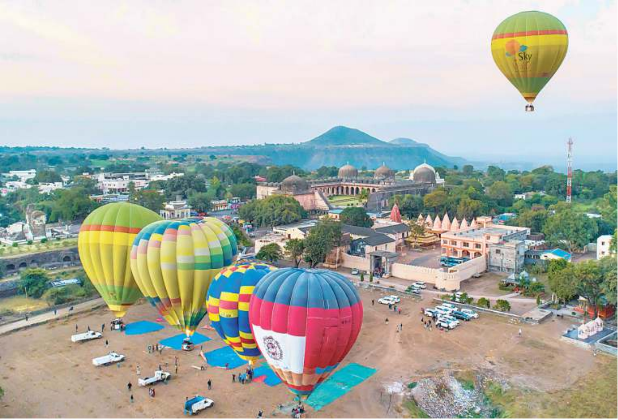
Hot air balloons in front of the Jahaz Mahal on the last day of Mandu Festival in Madhya Pradesh on Wednesday.