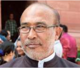
N. Biren Singh.

tal of 233 insurgency-linked incidents were reported in 2016, which came down to 167 in 2017 and 127 in 2018.