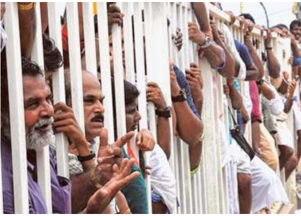
No consensus: A file photo of Jacobites staying inside the church as members of the Orthodox faction came to pray.

As per the ordinance, members of both factions could use the graveyard in their parish after conducting the last rites by a priest of their choice outside the church. Within the church, they would have to seek the