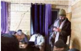
A journalist draws a blank on his cellphone at a media facilitation centre in Srinagar.

Tens of thousands of users of companies such as Airtel and Reliance Jio complained