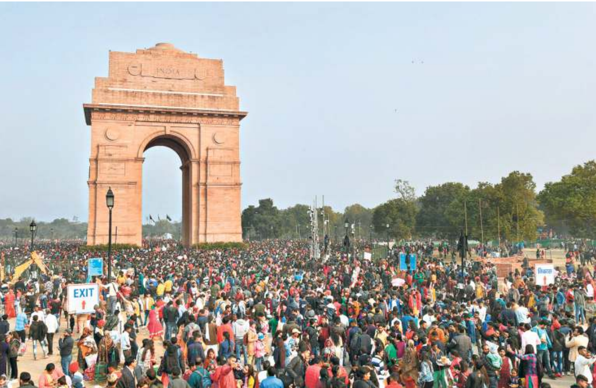
Making the most of it: Revellers take advantage of a sunny day to celebrate the New Year at India Gate; people enjoying themselves at Rajpath on Wednesday.