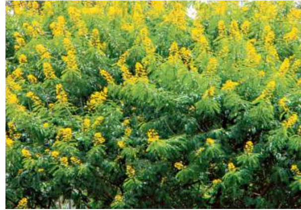
Dangerous trend: Invasive plants such as Senna Spectabilis arrest the growth of other indigenous species of trees.

The tree species had been found in nearly 10 km sq