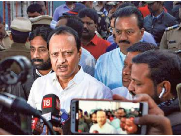
Deputy Chief Minister of Maharashtra Ajit Pawar addresses the media at Bhima-Koregaon on Wednesday.

Mr. Fadnavis said the voters were not at fault for giving a clear mandate to the BJP-Sena alliance in the Assembly polls. He said, “But it is the Sena which backstabbed the voters and betrayed their mandate. A government with this foundation cannot run for long,” he said. The zilla parishad polls will be held in Palghar on January 7 and the results will be declared the next day.