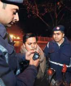
The police said that most of the violators were youngsters. ■FILE PHOTO

STAFF REPORTER NEW DELHI A total of 352 challans were issued for driving drunk on New Year’s Eve – a 30.8% dip compared to 2018 and nearly 80% less than 2017, said the police on Wednesday. In 2018, 509 challans were issued for drunk driving; in 2017, 1,752 challans were issued. This year, violators were mainly youngsters and middle-aged, the police said. There are several reasons behind the decline, including people being more aware of police strictness, increased police presence, and steeper fine under the amended Motor Vehicle Act, said the