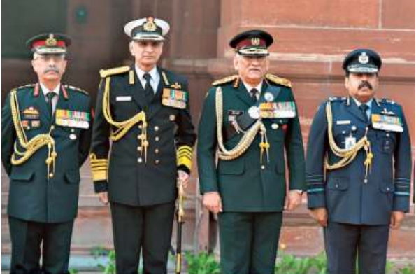
Chief of Defence Staff Gen. Bipin Rawat with Army chief Gen. M.M. Naravane, Navy chief Adm. Karambir Singh and Air Chief Marshal Rakesh Kumar Singh Bhadauria in New Delhi.