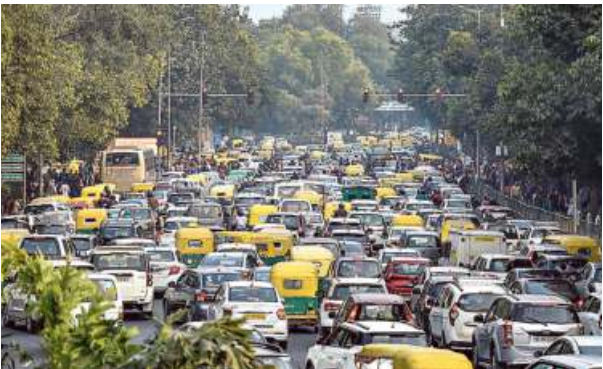
Day into night: Traffic jam at India Gate; congestion near ITO on Wednesday.