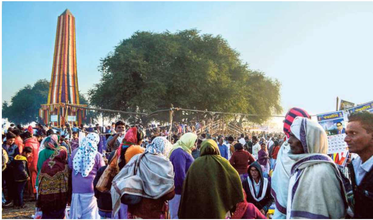
Battle remembered: People assembling at the 'Jayastambh' (victory pillar) at Koregaon-Bhima in Perne village, Pune, on the 202nd anniversary of the battle between the East India Company and the Peshwas in 1818. • JIGNESH MISTRY (REPORT ON PAGE 7)