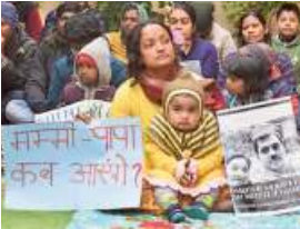
The activist couple's daughter at a prayer meet. • FILE PHOTO

The incarceration of the couple, who run an NGO, Climate Agenda, in Varanasi,