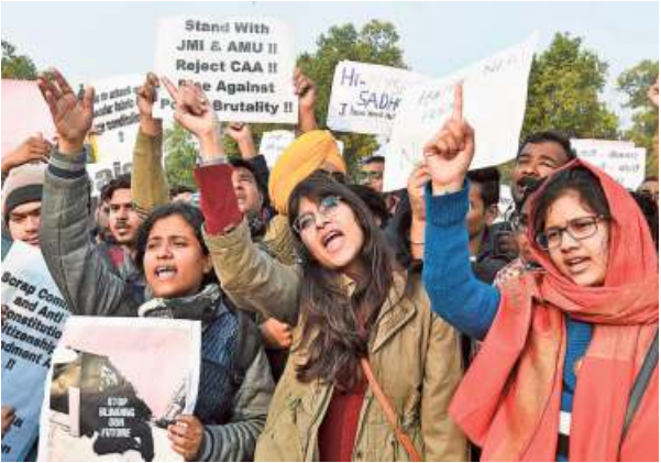
Students of Jamia university protesting against the citizenship law at India Gate on Wednesday.