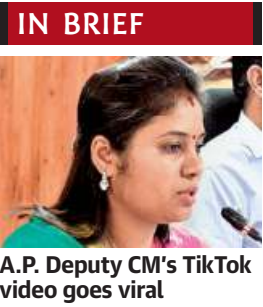
A.P. Deputy CM's TikTok video goes viral

VIJAYAWADA Andhra Pradesh Deputy Chief Minister P. Pushpa Sreevani's TikTok video on Chief Minister Y.S. Jagan Mohan Reddy has gone viral on the social media platforms. In the video, she is seen praising Mr. Reddy through a song, "Rayalaseema muddu bidda mana Jagananna." It comes in the wake of the government's plan to have three capitals. There is a demand to make the Rayalaseema region the Executive capital.