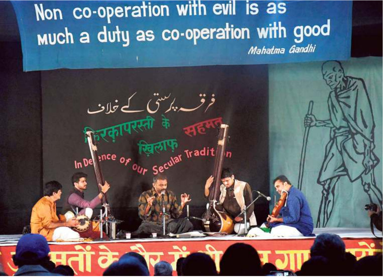
Carnatic vocalist T.M. Krishna performing in New Delhi on Wednesday. Several activists and artistes recited poems, sang songs and performed plays to express their solidarity with people protesting against the amended citizenship law. They had gathered at the Constitution Club of India under the aegis of Safdar Hashmi Memorial Trust (SAHMAT).