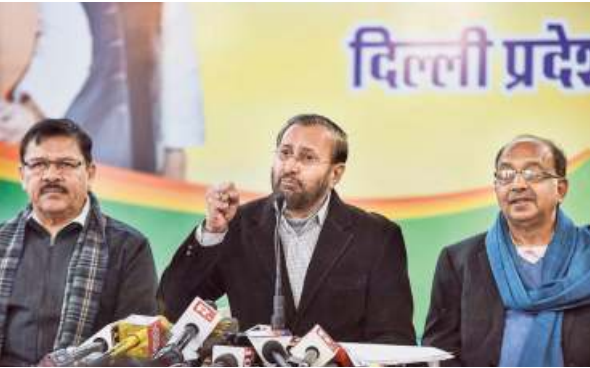
Union Minister Prakash Javadekar, flanked by BJP leaders Shyam Jaju and Vijay Goel (right), addressing a press conference in New Delhi on Wednesday.