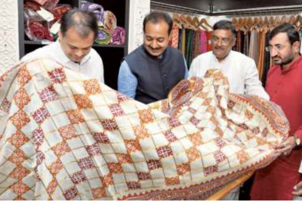
Products on display at a Garvi Gurjari showroom.

Dharmendrasingh Jadeja, Minister of State, Cottage Industries, Food and Civil Supplies and Consumer Protection, Government of Gujarat said, “Our showrooms are getting good response as all the products are made by the artisans and artists from various districts of Gujarat.” He said the main