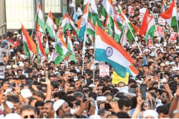
Huge protest: Muslim organisations taking out a massive rally against the CAA in Kochi on Wednesday.

The legislation goes against the secular traditions of India, says IUML leader