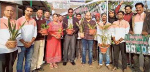
Berhampur Sabuja Bahini activists with plants to be given away to area residents.

Corporation had also appreciated their effort and imposed fine on persons and institutions hurting trees. This effort is being replicated in other urban areas.