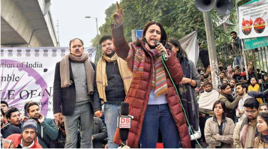
Actor Swara Bhaskar addressing a gathering outside gate number 7 of Jamia Millia Islamia in the city on Wednesday.

Actor lauds students’ efforts in continuing protests; she also visits protest site at Shaheen Bagh