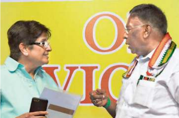
Conflict returns: The SEC appointment has become the latest flash point between Puducherry Lieutenant Governor Kiran Bedi and Chief Minister V. Narayanasamy.

"The incumbent SEC was appointed after the Speaker gave the right to the elected government to appoint the poll officer. MHA has not cancelled the appointment. Moreover, the MHA or Lieutenant Governor have no