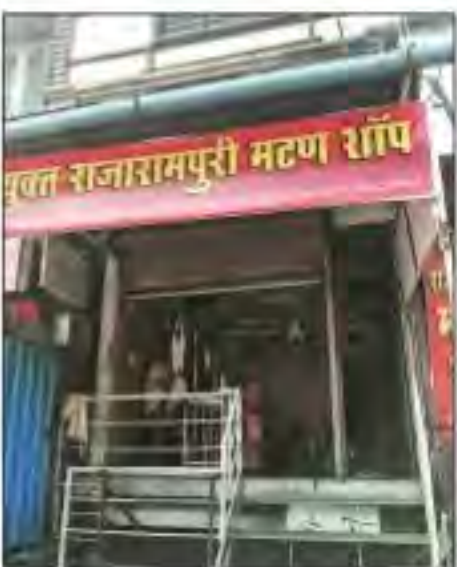
Citizens' shop offers mutton at Rs 480 per kg. Express

Shashikant Shetke, who manages the Rajarampuri shop,