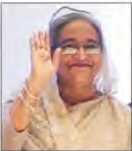
Bangladesh PM, however, said CAA and NRC are India's 'internal matters'.

During the interview in UAE's capital Abu Dhabi, where Hasina had gone on a bilateral visit last week, she said that she did not understand the purpose of the CAA passed in India, which aims