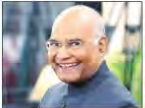
President Ram Nath Kovind

Administered by the Ramnath Goenka Memorial Foundation, the Awards have be-