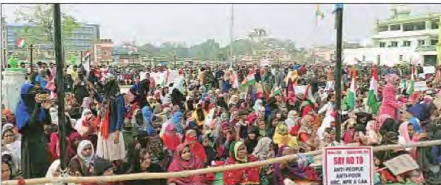
Organisers said some 70,000 protested on Saturday, including 30,000 women. Abhishek Angad