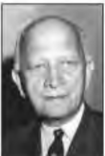
Image grab of the note (above); He didn't want linguistic states

Karnataka's state archives. It was written as a clarification for the public after Cariappa had met