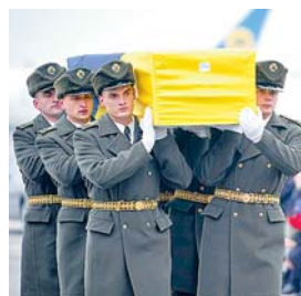
Soldiers carry the flag-draped coffins of the 11 Ukrainians who died in a plane mistakenly shot down by Iran at Kiev's Boryspil airport on Sunday

Earlier Sunday the black-clad Ukrainian leader, Prime Minister Oleksiy Goncharuk and top officials stood on the tarmac outside the terminal to see the caskets with the remains of the downed plane's nine Ukrainian flight crew and two passengers being removed from the aircraft.