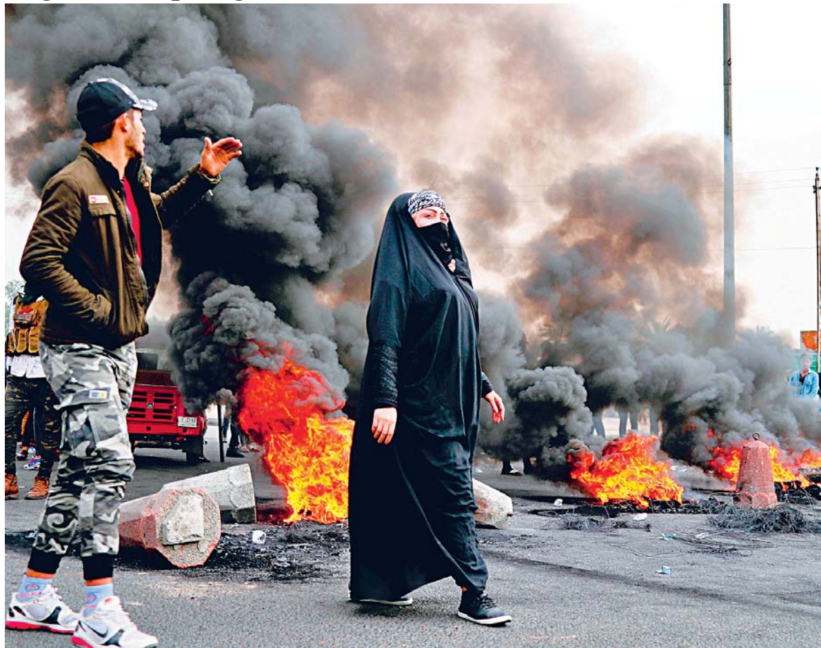
Iraqi youth angry at their government's glacial pace of reform ramped up their protests on Sunday, sealing streets with burning tyres and threatening further escalation unless their demands are met. The rallies demanding an overhaul of the ruling system have rocked Shiite-majority parts of Iraq since October, but had thinned out in recent weeks amid rising Iran-US tensions.