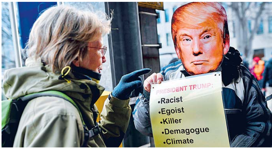
An activist wearing a mask depicting US President Donald Trump holds a placard as he takes part in a gathering called by activists in Landquart on Sunday

Trump has been impeached on charges that he abused his office to try and force Ukraine into digging up dirt on leading Democratic presidential candidate Joe Biden by withholding $400 million in military aid and a White House meeting with his Ukrainian counterpart