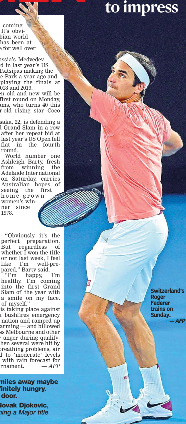
Switzerland's Roger Federer trains on Sunday.