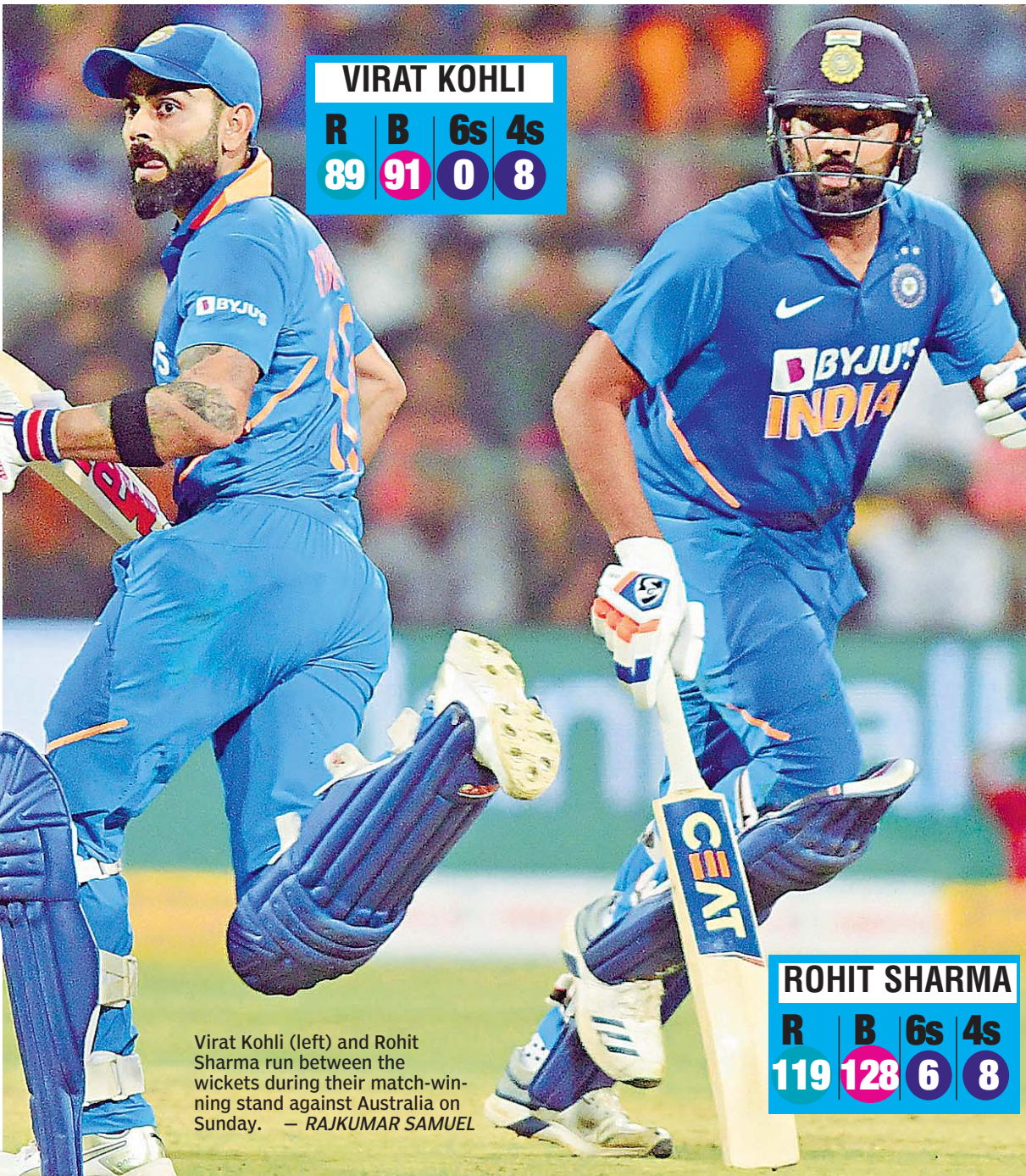
Virat Kohli (left) and Rohit Sharma run between the wickets during their match-winning stand against Australia on Sunday.

Jadeja broke the crucial 127 run partnership having Labuschagne hit through the off side as