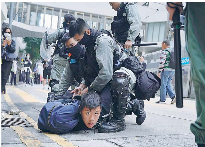
Riot police detain a protester in Hong Kong on Sunday — AP

While the framework of "one country, two systems" promises the city greater democratic rights than are afforded to the mainland, protesters say their freedoms have been steadily eroding under Chinese President Xi Jinping. — AP