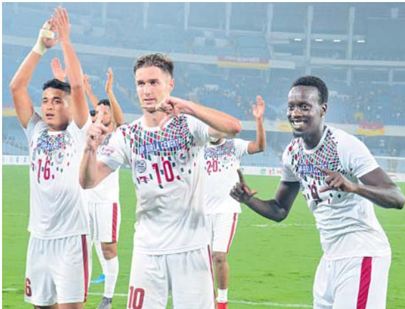
Mohun Bagan players celebrate their 2-1 win over East Bengal in their I-League match in Kolkata on Sunday.

And Mohun Bagan made it special, winning their first derby since January 21, 2018 — a 2-0 win in I-League. Since then, Mohun Bagan had failed to win from four matches, including two in I-League. — PTI