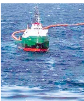
Indian nationals were released on Saturday while one died in the captivity of the pirates in

The High Commission of India in Abuja on Sunday tweeted that 19