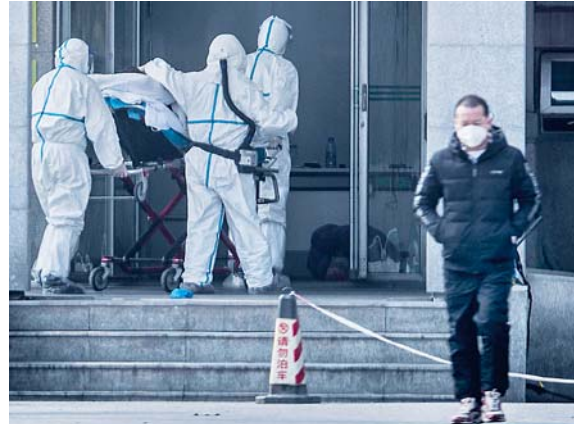
Medical staff members carry a patient into the Jinyintan hospital in Wuhan in China.

India on Friday issued an advisory to its nationals visiting China following a second death due to