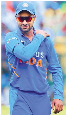
Shikhar Dhawan leaves the ground after injuring his shoulder while fielding.

Dhawan had suffered a thumb fracture during the World Cup in Australia and after returning to the side he sustained a knee injury during the Mushtaq Ali trophy, requiring 27 stitches. — PTI