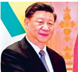
Chinese President Xi Jinping

"President of China, Mr. Shithole, signed a guest