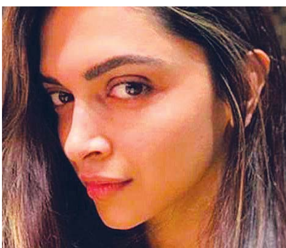
Deepika Padukone to speak on mental health

Underpinning the meeting will be the Davos Manifesto 2020, a document that builds on the original Davos Manifesto of 1973, which set out for the first time the stakeholder concept that businesses should serve the