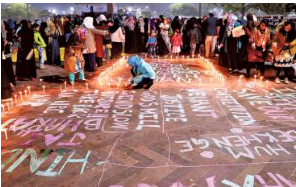
On the ground: Women writing slogans on the floor during a protest at Ghanta Ghar in Lucknow on Monday.

The SHO of Thakurganj police station, where the FIRs were lodged, confirmed to The Hindu that the protesters were booked in three separate cases but no arrests were made yet.