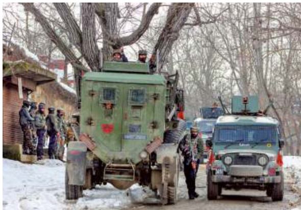
On their toes: Army jawans during an encounter with terrorists in Shopian district of J&K on Monday.