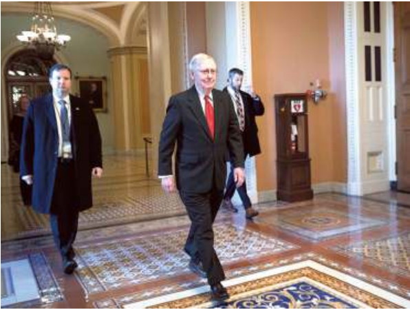
Intense phase: Senate Majority Leader Mitch McConnell, centre, arriving at the Capitol Hill on Tuesday.

vestigations into Mr. Trump's rivals). He was also charged with obstruction of Congress. Mr. Trump's legal team, which includes Ken Starr, the independent prosecutor from the Bill Clinton impeachment, as well as constitutional lawyer Alan Dershowitz, filed a 171-page trial brief on Monday, arguing that an impeachable offence must include criminal behaviour. Trial rules Mr. McConnell's resolution on trial rules, which will be taken up by the GOP-controlled Senate on Tuesday, gives House "managers", who will serve as the prosecution, and the President's defence team 24 hours each, over two days, to present their opening arguments. Given that the trial sessions start at 1 pm each day, Mr. McConnell's proposed rules could mean that opening arguments will run late into the night, or early morning hours – a schedule that