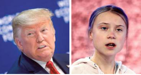
Donald Trump and Greta Thunberg at Davos.

U.S. President Donald Trump took aim on Tuesday at the "perennial prophets of doom" on the environment, telling the annual Davos forum that warnings of climate crisis were "foolish". In a keynote speech to the 50th World Economic Forum in the Swiss ski resort, Mr. Trump touted fossil fuels, deregulation and a booming U.S. economy – a message in stark contrast to the dire warnings delivered by teenage campaigner Greta Thunberg and others. 'Buy oil, gas from us' "We must reject the perennial prophets of doom and their predictions of the apocalypse," Mr. Trump said hours after Ms. Thunberg told the World Economic Forum that governments had done "basically nothing" to reverse climate change.