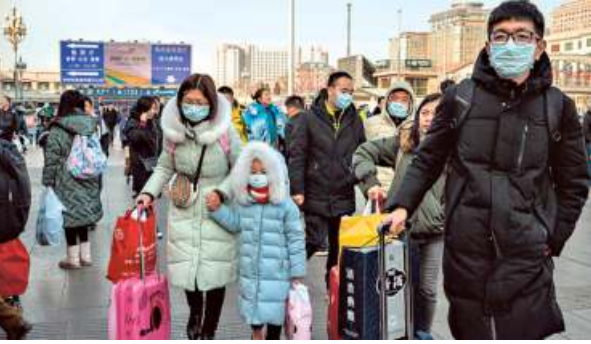
Anxious travellers: People arriving at the Beijing railway station to head home for the Lunar New Year on Tuesday.