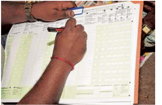
Mammoth exercise: Thirty lakh enumerators will be assigned the task of collecting details across the country.

The National Population Register (NPR), which has been objected to by several