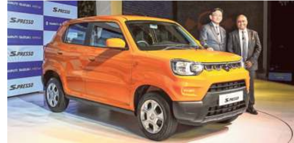
Tech change: Ten models, such as the S-presso, Baleno, Alto 800 and Dzire come with BS-VI compliant engines. • PTI

Prepaid gift cards and those used at mass transit systems have been kept out of this new rule.