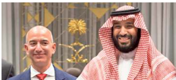
In happier times: A file photo of Saudi Arabia's Crown Prince Mohammed bin Salman with Amazon chief Jeff Bezos.

Cybersecurity experts hired by Mr. Bezos, the world's richest man, concluded his phone was probably infiltrated by a video file sent from a WhatsApp account purportedly be-