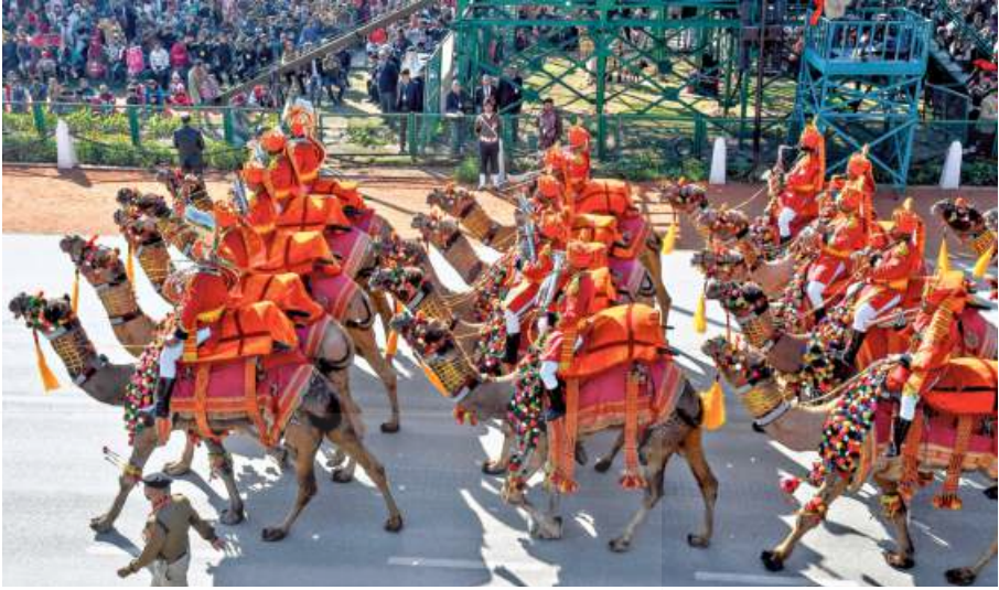
Getting it right: The BSF camel contingent at the full dress rehearsal for the Republic Day parade at Rajpath in New Delhi on Thursday. Several roads were closed for the rehearsal, leading to traffic snarls in the city. (REPORT ON PAGE 9)

'A judge can only ensure punishment is proportionate'