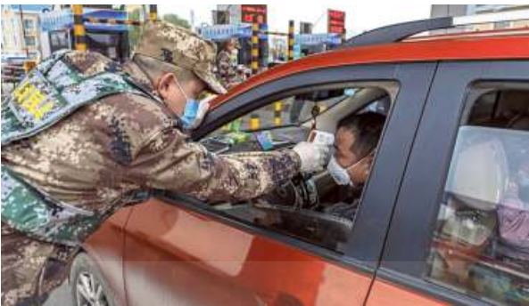
On alert: A soldier uses a digital thermometer to check a driver's temperature in Wuhan on Thursday.

Streets and shopping centres in Wuhan, with a population of 11 million, were eerily quiet after authorities told residents not to leave the city, where most of