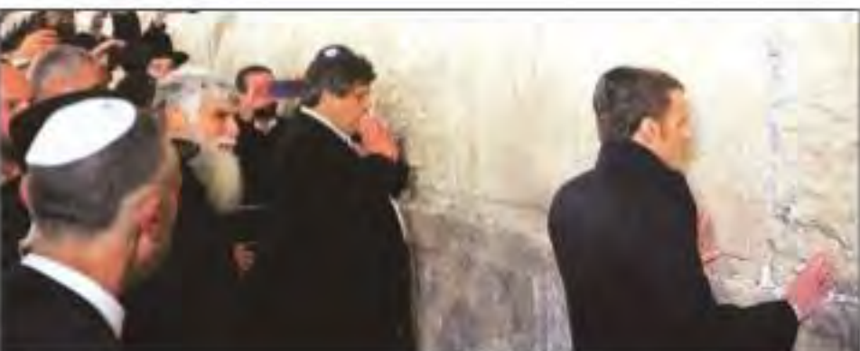
Macron at the Western wall, in the Old City of Jerusalem.

The incident occurred during a spat between Israeli forces and Macron's own security detail as he entered the Church of St. Anne. The church, located in Jerusalem's Old City, is French