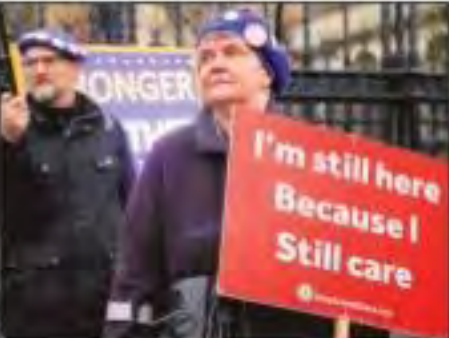
Anti-Brexit protesters outside Parliament in London.

and division of the past three years behind us and focus on delivering a bright, exciting future." The January 31 split caps a remarkable political comeback for Johnson at one of the most difficult points in Britain's post-war history. Johnson will celebrate his victory by issuing commemorative coins and chairing a special cabinet meeting in England's pro-Brexit north on January 31. He will now be responsible for defining the terms on which Britain trades and shares everything from data to fishing waters with the remaining 27 EU member states.