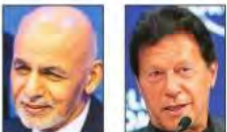
Ashraf Ghani, Imran Khan

Ghani said he is yet to see a breakthrough in his talks with Pakistan on this issue, and has only seen some "good statements" coming out from Islamabad so far.