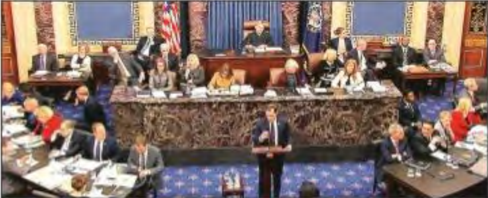
During the trial in Washington.

The lawsuit, filed in New York, has claimed that Gabbard suffered an economic loss to be proven at trial. "Hillary calling me a Russian asset is not only intended to smear my reputation and derail my campaign... it's also intended to silence any voice that dares to speak out against the establishment status quo," Gabbard said. PTI