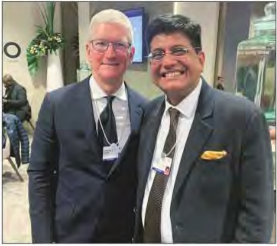
Commerce and Industry Minister Piyush Goyal with Apple CEO Tim Cook at the 50th World Economic Forum annual meeting in Davos Thursday.

He was talking at a session on 'Strategic Outlook: India' at the WEF 2020 here. "If I weren't a minister today, I would be bidding for Air India. It has some of the best bilaterals the world over... a well managed and efficient Air India