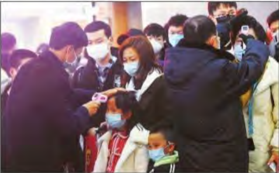
Officials check body temperatures of passengers arriving at Hangzhou from Wuhan, at Hangzhou railway station in Zhejiang province.

Most transport in Wuhan, a city of 11 million people, was sus-