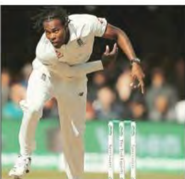
An elbow injury kept Jofra Archer out of the second and third Tests. File