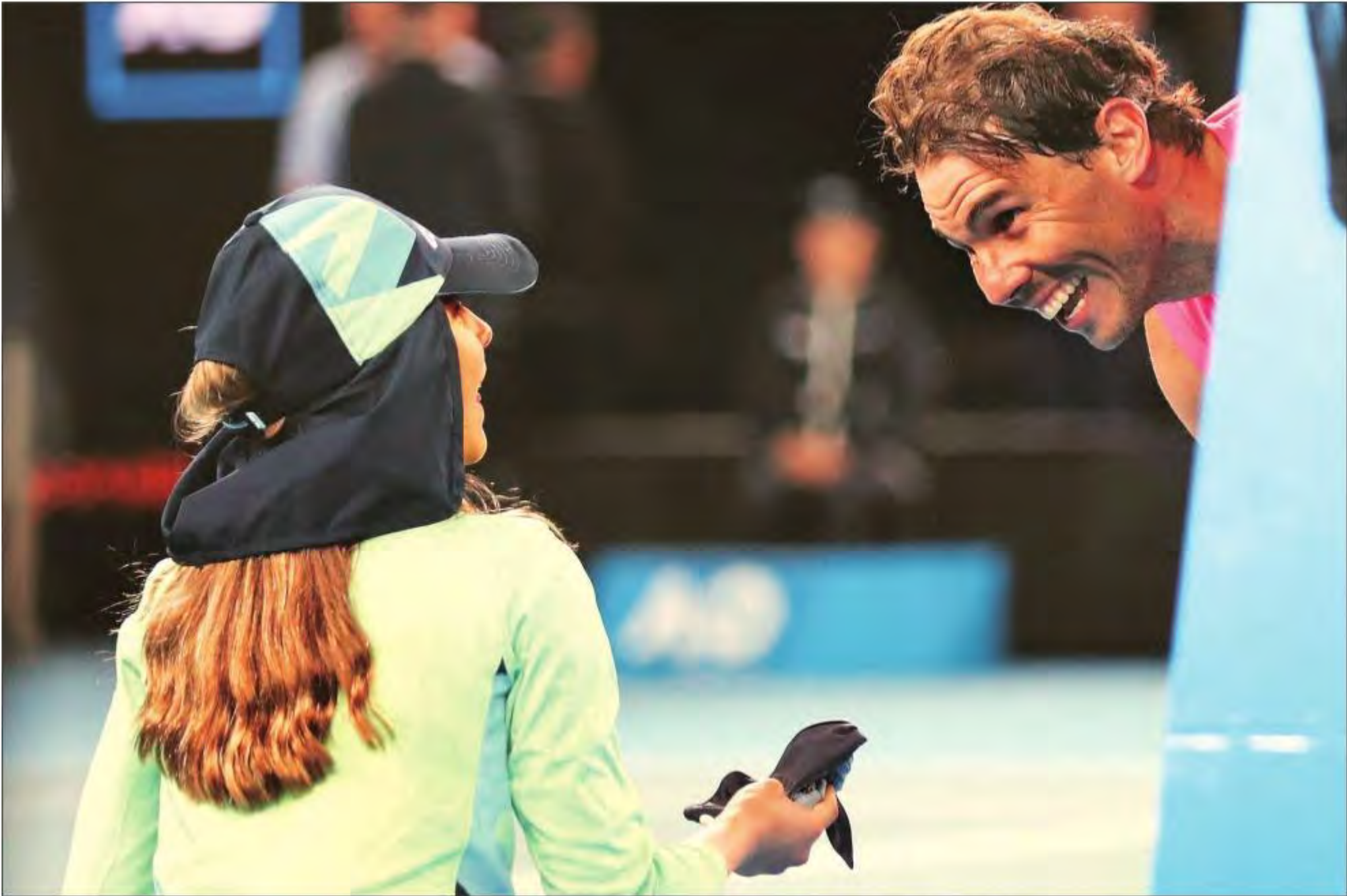
Rafael Nadal passes a ball girl his head band after a miscued shot struck her flush on the forehead during the match against Argentina's Federico Delbonis.

Post a spell of rain that left the courts muddy, Nadal outclasses dogged Delbonis; Kyrgios subdues Simon