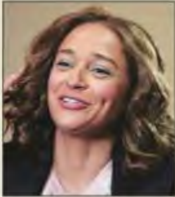
Isabel dos Santos, Africa's richest woman, is a suspect in a fraud case.

Lisbon: Angola could issue an international arrest warrant for billionaire Isabel dos Santos if she fails to cooperate with a fraud investigation in which she has been named as a suspect, its chief prosecutor was quoted as saying. Angola has named dos Santos, the daughter of former President Jose Eduardo dos Santos and reputedly Africa's richest woman, as a suspect over alleged mismanagement and misappropriation of funds while she was chairwoman of state oil firm Sonangol in 2016-2017.