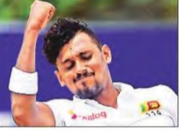
Fast bowler Suranga Lakmal finished with figures of 4 for 27. File

of wiping out that lead and saving the first Test they have played since November 2018. Lakmal, however, was quick to make inroads, removing the top three, all left-handers, in his first three overs as Zimbabwe crumbled to 41 for three.