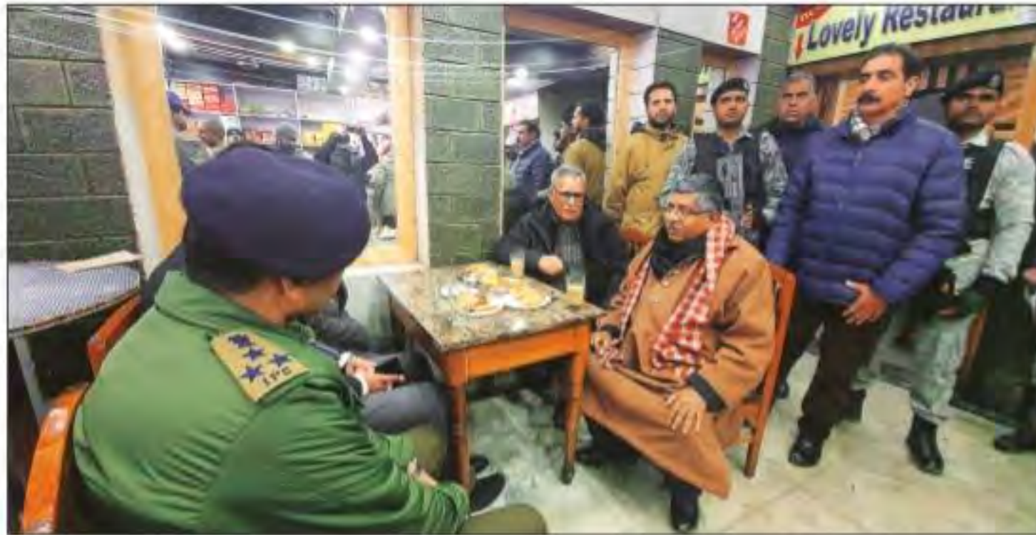
Union Minister Ravi Shankar Prasad at an eatery in Baramulla on Thursday.