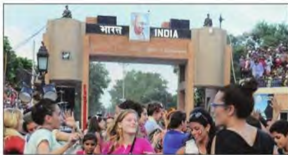
Mahatma Gandhi's portrait atop the 'Swarn Jayanti Dwar'; (right) The visitor's gallery after it was renovated sans the portrait.

Under the new design, "India" is inscribed on top of the gallery facing Pakistan, and "First Line of