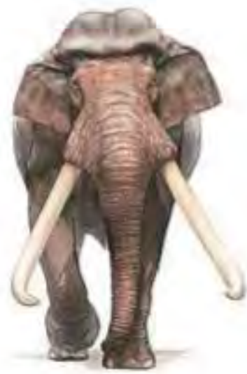
Reconstructed life appearance of European straight-tusked elephant. Hsu Shu-yu, University of Bristol

One key point of confusion was the different sizes of skull crests in fossils found in Europe. For a long time, it was thought that the European species had a rather slenderly built skull roof crest, whereas