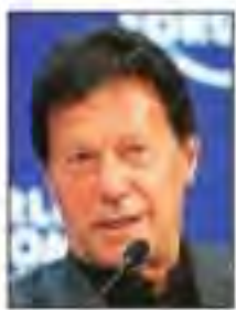
Brokering Taliban deal has helped Pak score points

At the meeting Wednesday, Pakistan defended the country's compliance report on combating terror-financing networks. Diplomatic sources present at the meeting told The Indian Express : "It was a bit surprising the way US, UK, France, Germany, Australia, New Zealand and even Japan, all of