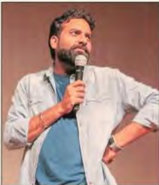
Anubhav Singh Bassi

Bassi's show, Bas Kar Bassi, is a two-hour gig, with most of humour coming from his own experiences. In the past, he