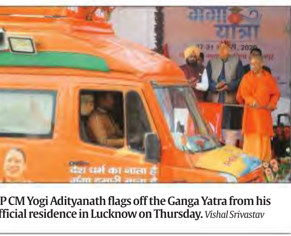
UP CM Yogi Adityanath flags off the Ganga Yatra from his official residence in Lucknow on Thursday.