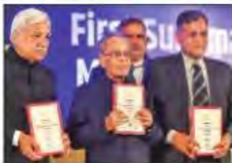
Mukherjee with CEC Sunil Arora (left) and EC Ashok Lavasa in Delhi.

He also said that the youth's "assertion and belief in the Constitution of India" is heartening. Democracy, he said, thrives on "listening, deliberating, discussing, arguing and even dis-