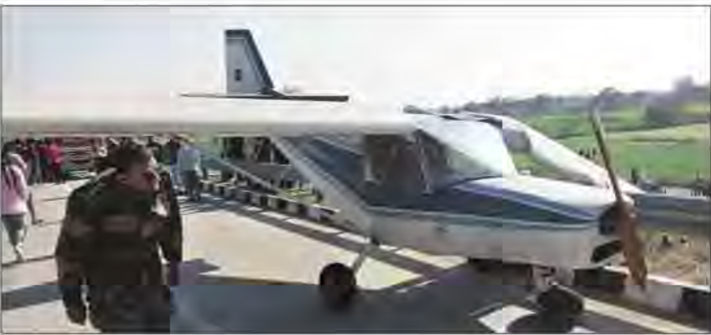
The two pilots in the aircraft were rescued after an operation by the IAF. Express

According to sources, the aircraft was being flown by a Group Captain and a Wing Commander of the Indian Air Force, and was due to land at the Hindon Airbase in Ghaziabad. The pilots manoeuvred the plane at the last minute to avoid landing amidst traffic on the