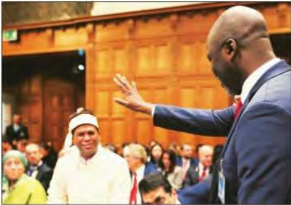
Gambia's Justice Minister Abubacarr Tambadou waves at Rohingya representatives at The Hague.

Myanmar must use its influence over its military and other armed groups to prevent vio-