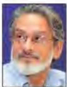
Pronab Sen heads new panel on economic statistics

The NDA government has come under fire for repeated instances of data suppression across ministries, including the delay in the release of Periodic Labour Force Survey for 2017-18,