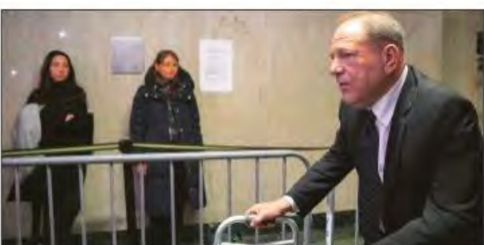
Harvey Weinstein leaves court in New York.

"I was trying to get him off me," a tearful Sciorra told the jury. "I was punching him, kick-