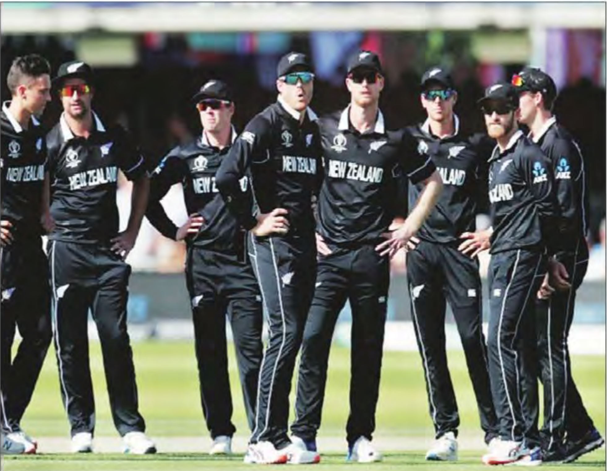
New Zealand have a relatively smaller talent pool but have consistently punched above their weight.

Towards the second half of the last decade, there was a frenetic scramble among cricket boards to set up their own T20 league, along the lines of the IPL. The NZC, however, refrained from getting into this race. Instead,