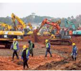
Construction underway at the site for a field hospital in Wuhan.

AGENCE FRANCE-PRESSE BEIJING China is rushing to build a new hospital in a staggering 10 days to treat patients at the epicentre of a deadly virus outbreak that has stricken hundreds of people, state media reported on Friday. The facility in the central city of Wuhan is expected to be in use by February 3 to serve a rising number of patients infected by a coronavirus. Dozens of excavators and trucks were filmed working on the site by State broadcaster CCTV. The hospital will have a capacity of 1,000 beds spread over 25,000 square metres (270,000 square feet), the official Xinhua news agency said. Construction began as reports surfaced of bed shortages in hospitals designated to deal with the