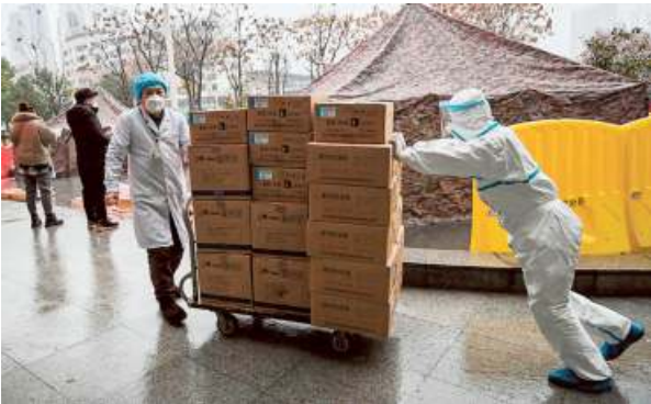
Dealing with the outbreak: Staff transporting medical supplies at the Wuhan Red Cross Hospital on Friday.

tory Syndrome), which killed hundreds across mainland China and Hong Kong in 2002-03. The WHO said China faced a national emergency but stopped short of making a declaration that would have prompted greater global cooperation. The outbreak emerged in late December in Wuhan, an industrial and transport hub of 11 million people in China's centre, spreading to several other countries, including the U.S. China is in the midst of its Lunar New Year holiday, a typically joyous time of family gatherings and public festivities. But on Friday, Wuhan was a ghost town, its streets deserted and stores shuttered. Worried patients Hospitals visited by AFP journalists bustled with worried patients being screened by staff wearing full-body protective suits. At a temperature-check