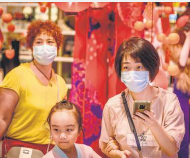
On guard: Women with face masks walk in a shop decorated for the Chinese Lunar New Year in Bangkok, Thailand, on Friday.

China is scrambling to contain a new virus that has killed more than two dozen people since January 11 December 31: China alerts the World Health Organization (WHO) about several cases of pneumonia in Wuhan. The virus is unknown January 5: Chinese officials rule out the SARS virus, which killed more than 770 people worldwide during 2002-03 January 7: The virus is identified. It is from the coronavirus family, which includes SARS and the common cold,