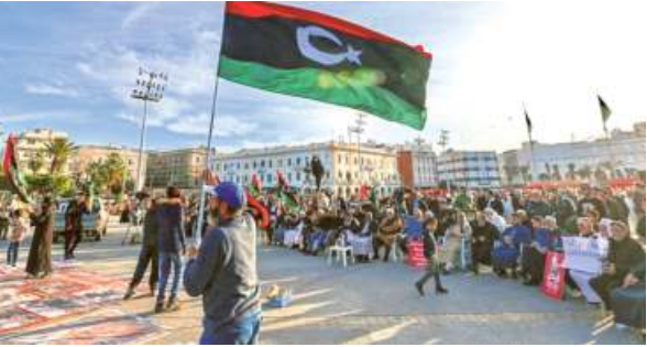
Peace derailed: Libyans take part in a demonstration against eastern strongman Khalifa Haftar in Tripoli.

The weak but UN-recognised government in the capital Tripoli is backed by