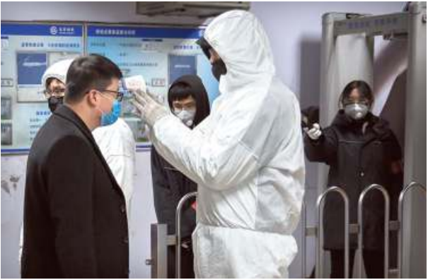
On guard: A Chinese health worker checking the temperature of a passenger at a subway station in Beijing.

China's National Health Commission Minister Ma