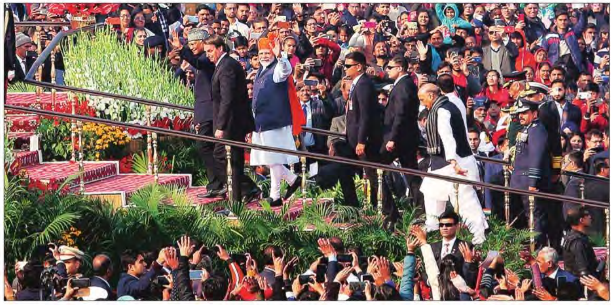
CELEBRATING REPUBLIC DAY President Ram Nath Kovind, Brazil President Jair Bolsonaro, Prime Minister Narendra Modi and Defence Minister Rajnath Singh at the Republic Day parade, in New Delhi on Sunday. FULL COVERAGE, PAGES 5, 6

NIV-Pune director says eight of 13 samples tested so far, all negative