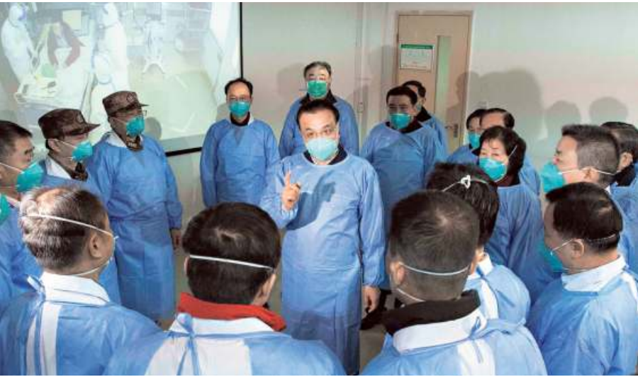
Pledge of support: Chinese Premier Li Keqiang, centre, speaking with medical workers at the Wuhan Jinyintan Hospital in central China's Hubei province on Monday.

"Li ... thanked frontline medical workers for their all-out efforts in treating patients and urged them to pay attention to their own protection," Xinhua news agency said. "He required efforts to guarantee medical resources supply, race against time to treat patients and ensure adequate market supply and stable prices." He said 2,500 more medical workers would arrive in the next two days. Mr. Li is the most senior leader to visit Wuhan since the outbreak began. He inspected efforts to contain the epidemic and was shown on state television leading medical workers in chants of "Wuhan jiaoyou!" – an exhortation to keep their strength up. He also visited the construction site of a new hospital due to be built in days. On China's heavily censored social media, where dissent is typically suppressed, local officials have borne the brunt of mounting public anger about the handling of the virus. Some lashed out at the Hubei Governor, who had to correct himself twice during a news conference over the