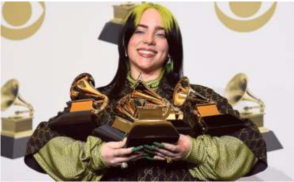
Ultimate win: Billie Eilish with the awards in Los Angeles.

Ms. Eilish, an 18-year-old auteur with a moody and idiosyncratic aesthetic, won five awards, including the four most prestigious and competitive prizes – album, record and song of the year, and best new artist. She was the first artist to sweep the top awards since Christopher Cross in 1981, besting competition from Lizzo, Lil Nas