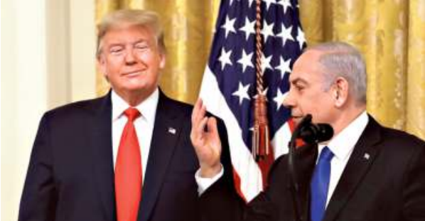
Talking peace: U.S. President Donald Trump and Israeli PM Benjamin Netanyahu, right, in Washington.

In exchange, Israel would agree to accept a four-year freeze on new settlement ac-