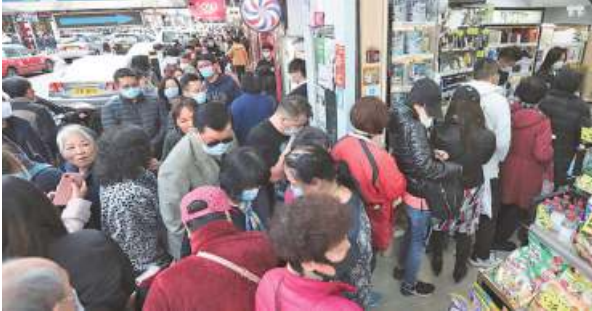
Desperate measures: People standing in queue for free masks outside a pharmacy in Hong Kong on Tuesday.

But others say local cadres had earlier been more focused on projecting stability than responding to the outbreak when it began