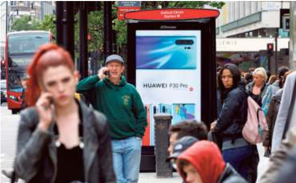
New connection: Pedestrians near a Huawei advertisement at a bus stop in central London.

The telecoms industry has warned that banning Huawei would cost it billions of dollars and delay the 5G roll-out. Huawei's equipment is already used by Britain's biggest telecoms companies such as BT and Vodafone,