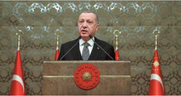
Military push: Turkish President Tayyip Erdogan speaking at a symposium in Ankara on Thursday.

and the United Arab Emirates. President Recep Tayyip Erdogan’s office confirmed last Friday that a request for military support had been received from the Tripoli-based Government of National Accord (GNA). No details have been given on the scale of the potential deployment, and Vice-President Fuat Oktay told state news agency Anadolu on Wednesday that no date had