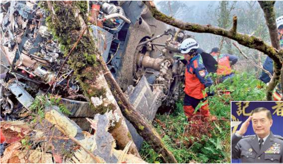
Major loss: A rescue team searching for missing military officers after the helicopter crashed near Taipei on January 2. Air Force General Shen Yi-ming, inset, died in the crash.

Five survive The reasons for the crash, in the wake of a forced landing, were unknown, the military said in a statement, adding that the chief of general staff, Air Force General Shen Yi-ming, had died, while five of the 13 aboard survived. Gen. Shen, who took up his post in July, was Taiwan’s highest-ranking general to die in the line of duty, President Tsai Ing-wen said, adding that she had asked the