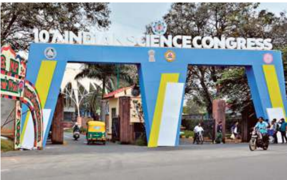
Preparations on: The GKKV campus in Bengaluru, where the Indian Science Congress will be held.

While pseudo-scientific remarks at the congress are not unprecedented — in 2015, at the event in Mumbai, there was an entire session dedicated to ‘aircraft