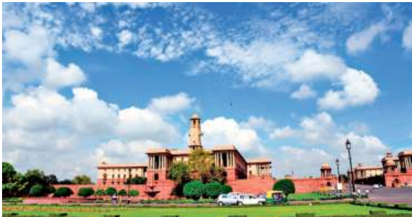
Big changes: Over 115 people have sent in their objections to the proposed changes in land use for the project.

As part of the project, the Delhi Development Authority (DDA) on December 21, 2019 issued a notification inviting suggestions and objections to its proposed land-