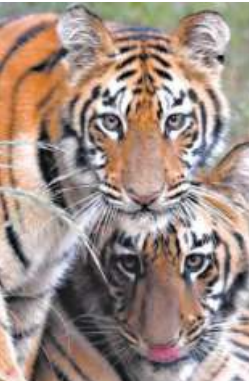
Tiger cubs at the Tadoba Andhari Reserve near Nagpur.

port, released in July 2019, had placed the number of tigers in India at 2,967, up by a third when compared with