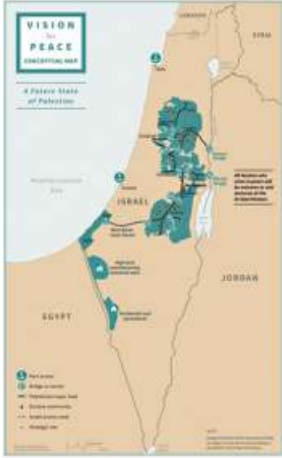
A map of the proposed Palestine state tweeted by the U.S. President.

Jerusalem, perhaps the most contentious issue, would be “the undivided capital” of Israel, with Palestine gaining its capital in the east of the city. In return, Israel would freeze further settlement activities on the