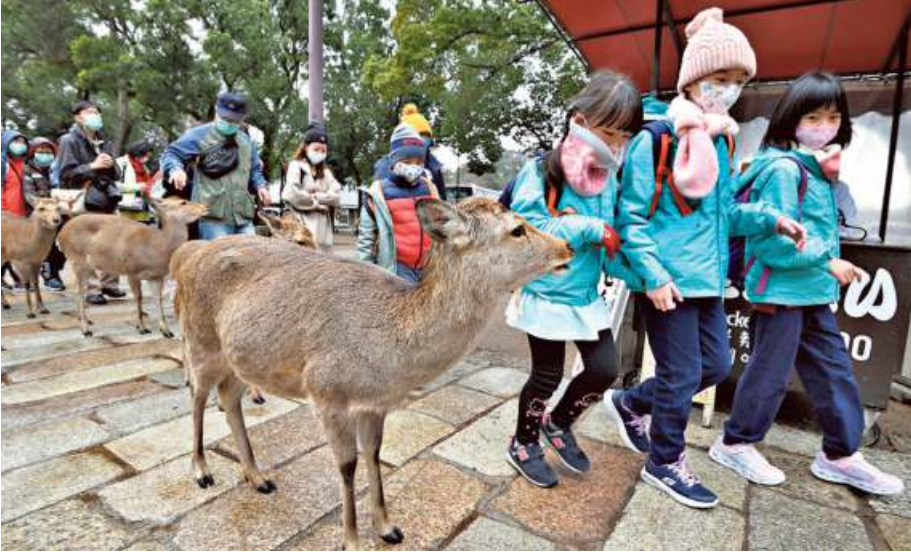
Staying safe: Children wearing face masks visit a park in Nara, western Japan, on Wednesday.

“In the last few days the progress of the virus especially in some countries, especially human-to-human transmission, worries us,” WHO chief Tedros Adhanom Ghebreyesus told a news conference in Geneva, naming Germany, Vietnam and Japan. Beijing’s plans to slay what its leader called the “devil” coronavirus may have won the trust of the WHO, but