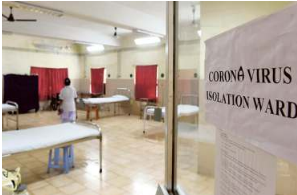
All ready: The new coronavirus isolation ward at TB and Chest Diseases Hospital in Puducherry on Wednesday.

Air India too cancelled its Mumbai-Delhi-Shanghai flights with effect from January 31, though it will continue to fly to Hong Kong.