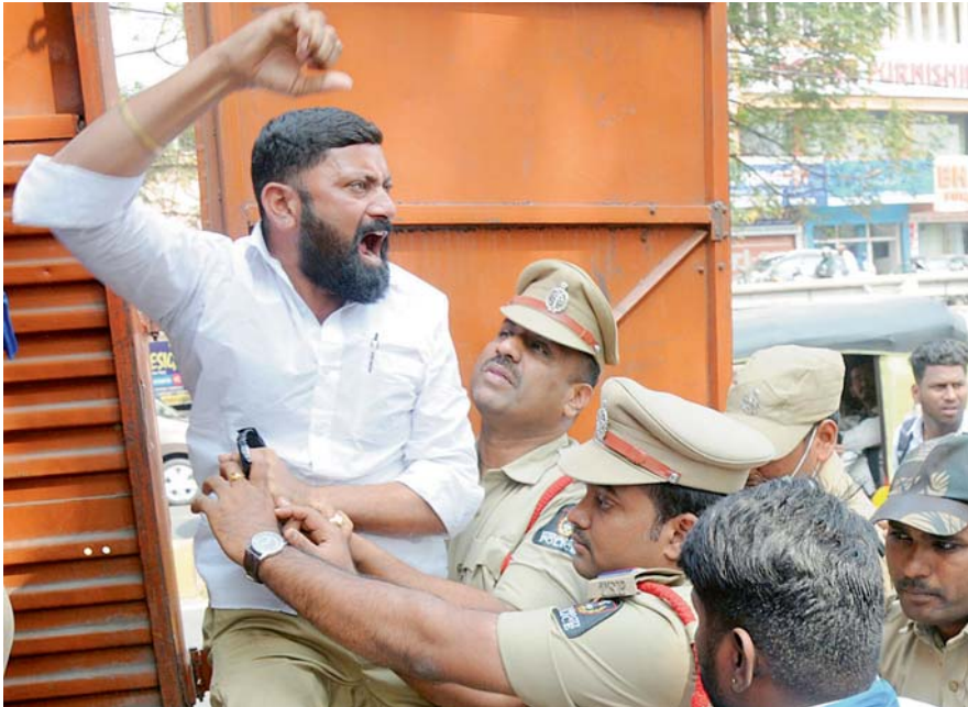
Cops picked up a few people after they tried to form a human chain near the Ambedkar Statue on Thursday