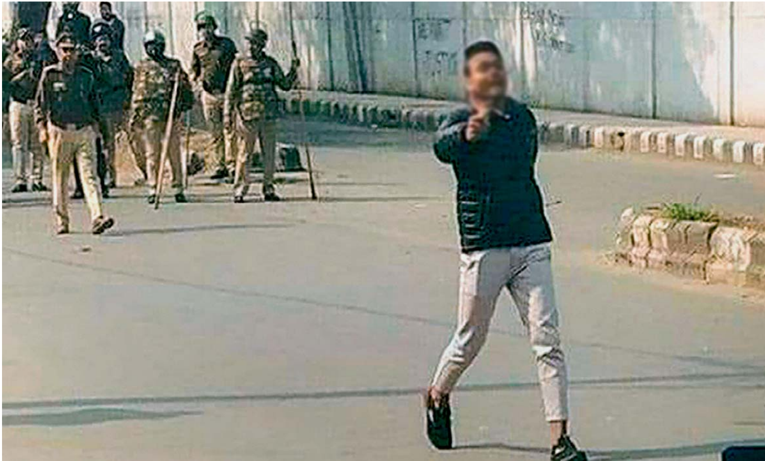
A juvenile (face blurred) brandishes a pistol while heading towards anti-Citizenship Amendment Act (CAA) protesters near Jamia Millia Islamia University in New Delhi on Thursday. He opened fire against the protesters injuring one student and causing panic.

■ Page 4: Husband thanks cops, judge for quick justice