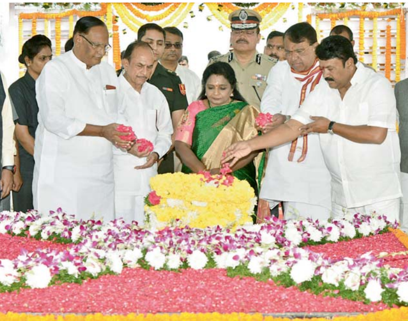
Governor Tamilisai Soundararajan, along with others, paying floral tribute to Mahatma Gandhi on his death anniversary at Babu Ghat in Hyderabad on Thursday.