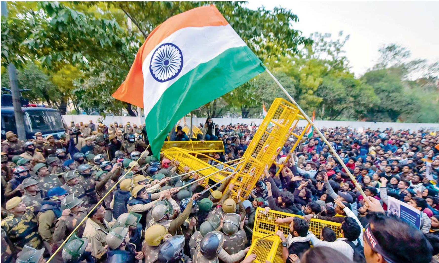
Students try to breach the police barricading during their protest march against the Citizenship Amendment Act and the National Register of Citizens, near Jamia Millia Islamia university in New Delhi, on Thursday.

As the lawyer appearing for the opposite party objected to the stay of the proceedings, CJI Bobde asked him to make a statement that he would not insist on written statement by Ms Kanimozhi before the high court.