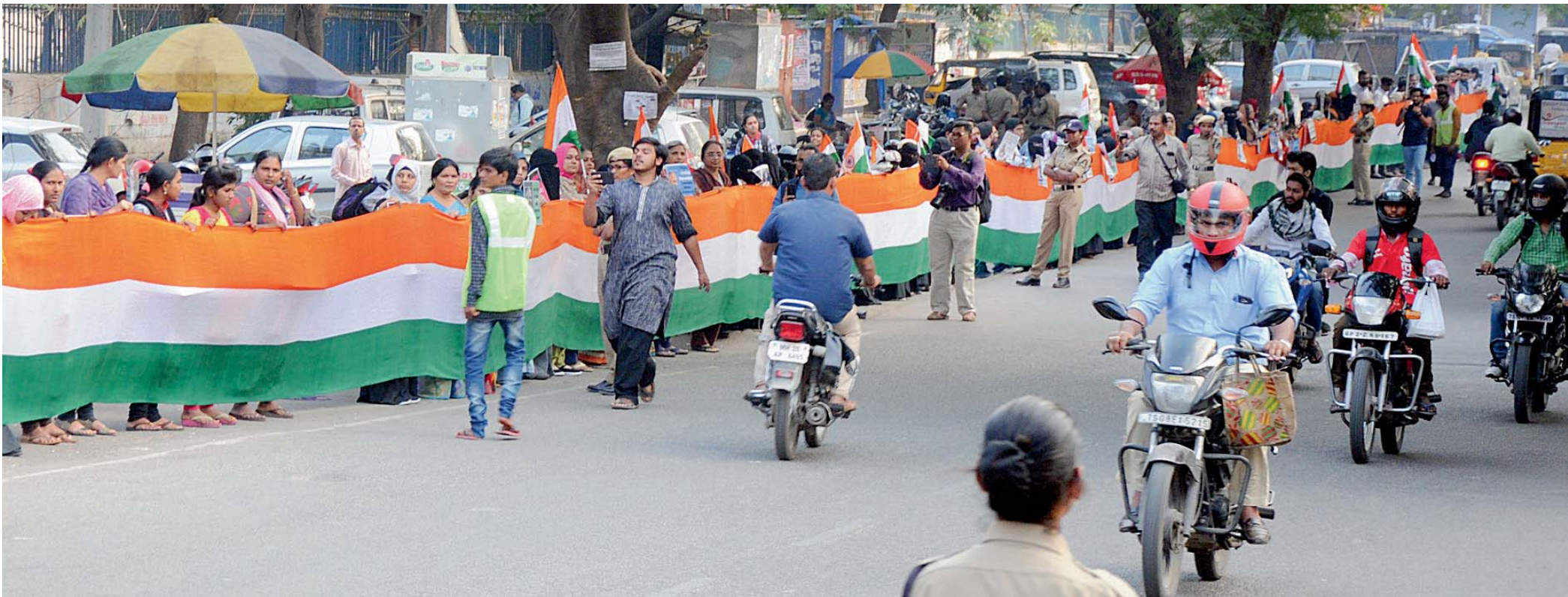
Over 1,000 people come together to form a human chain at Indira Park on Thursday

The Millet Sisters noted that with every decade of climate crisis familiar grains such as wheat and rice will disappear from the food basket and there will be nothing to offer in the food system. Millets with their extraordinary capacity to withstand climate change may be the only grains that can be tapped for public food systems. Therefore there is an immediate need to recognise millets as the food of the future for India and base all food planning on millets.