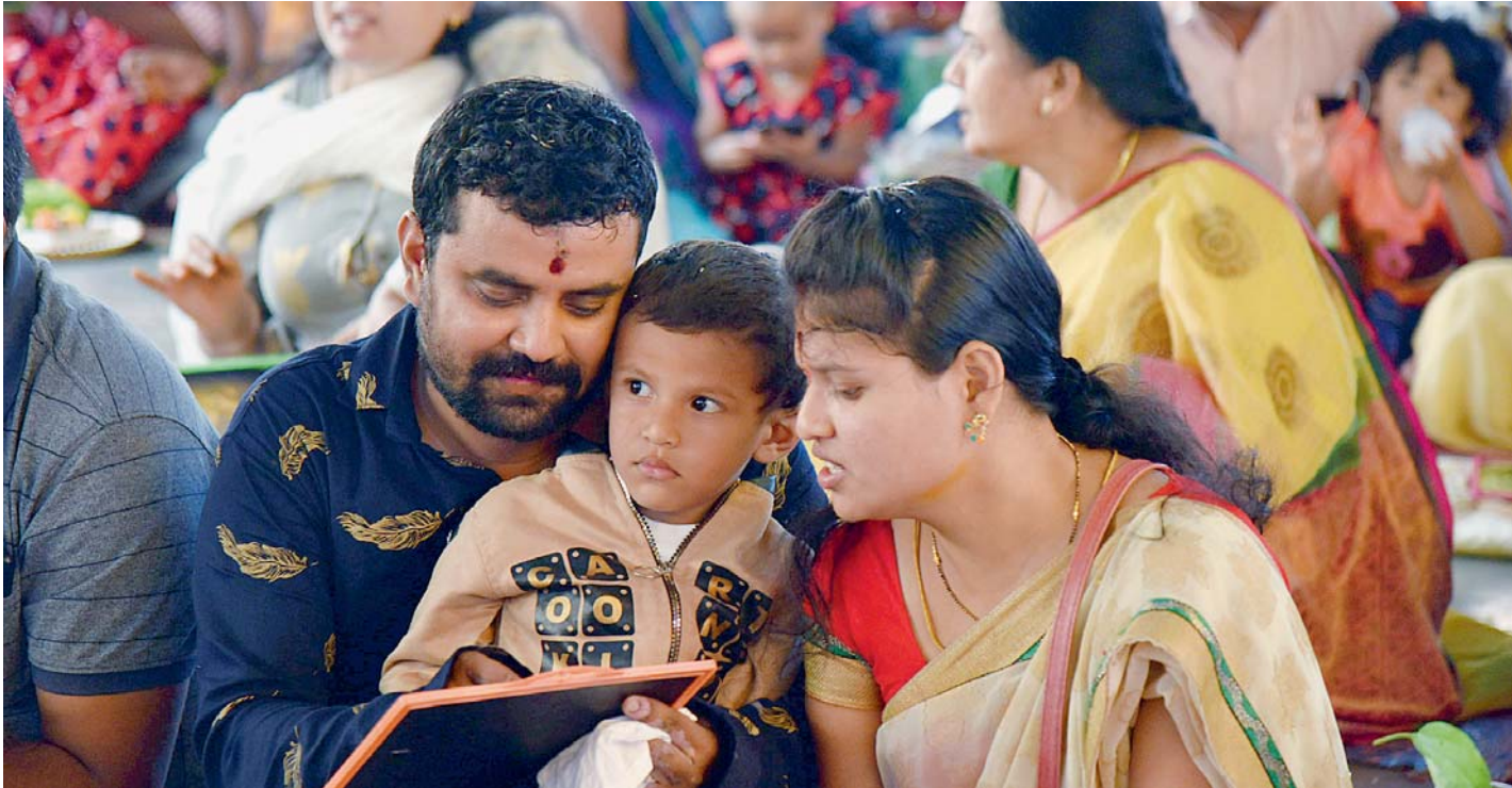
On the occasion of Basant Panchami, parents help their child for Aksharabhyasam (writing first alphabets) at Gnana Saraswati temple in Musheerabad, Hyderabad, on Thursday.