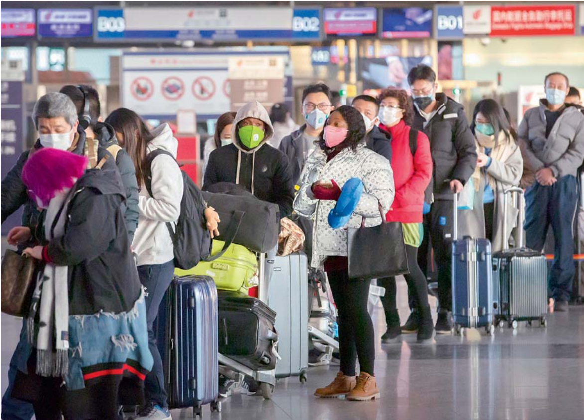
Travellers wearing face masks line up to check in for a flight at Beijing Capital International Airport, in Beijing on Thursday.

Chinese authorities are “stepping up efforts to ensure continuous supply and stable prices,” Xinhua reported.