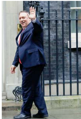
US Secretary of State Mike Pompeo arrives at 10 Downing Street in London on Thursday

US officials have warned that Washington