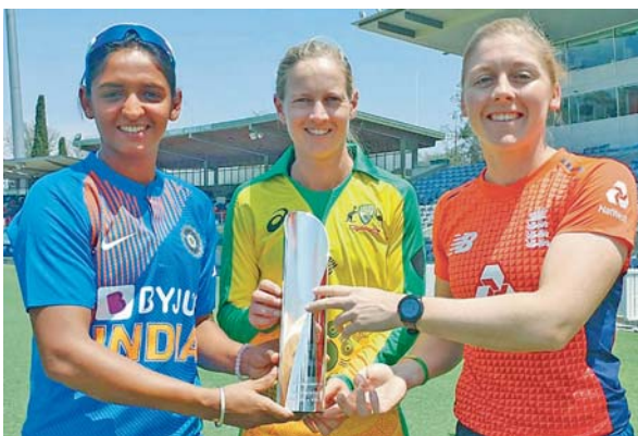
(from left) Indian captain Harmanpreet Kaur, her Australian counterpart Meg Lanning and England's skipper Heather Knight pose with the Commonwealth Bank T20 International Tri-series Trophy on Thursday.