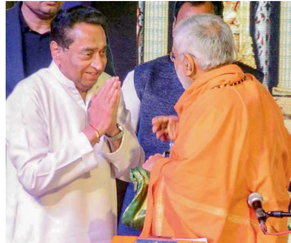
Madhya Pradesh CM Kamal Nath during a Hanuman Chalisa recitation programme on Thursday.

once again brought into focus ‘vaastu’ flaws in the MP assembly building.