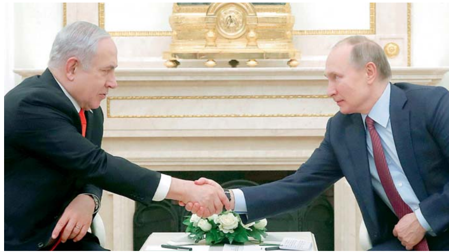
Russian President Vladimir Putin (R) shakes hands with Israeli Prime Minister Benjamin Netanyahu during their meeting at Kremlin in Moscow on Thursday

Netanyahu, facing graft charges, is contesting March elections and hoping the proposal will boost his re-election chances.