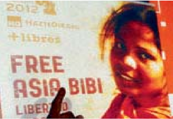
Asia Bibi was sentenced to death on blasphemy charges by a Pakistani court in 2010 but then dramatically acquitted in 2018.

French journalist Anne-Isabelle Tollet's book Enfin libre! on Bibi's life has been released