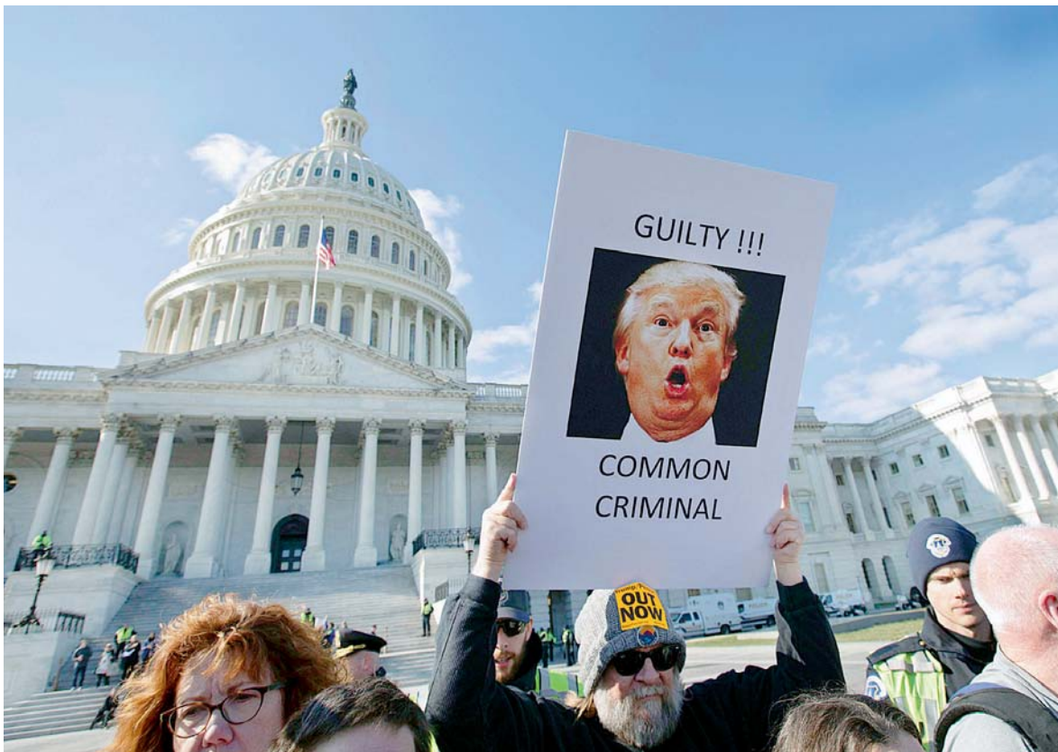
Demonstrators protest outside the Capitol during the impeachment trial of President Donald Trump in Washington

Democrats are pressing for the Senate to subpoena Bolton after reports that his White House memoir The Room Where it Happened corroborates the abuse-of-power impeachment charge against Trump. Bolton reportedly writes that the president personally told him in August a freeze in military aid to Ukraine was directly linked to Trump's demand that Kiev announce investigations into Joe Biden, the frontrunner for the Democratic presidential nomination. Several hours before the letter went public, Trump lashed out at Bolton on Twitter, saying he had written a "nasty & untrue book. All Classified National Security."