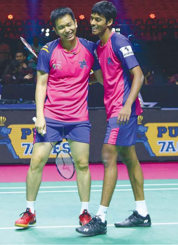
Pune 7 Aces duo Hendra Setiawan (left) and Chirag Shetty after their win in a PBL tie on Thursday.