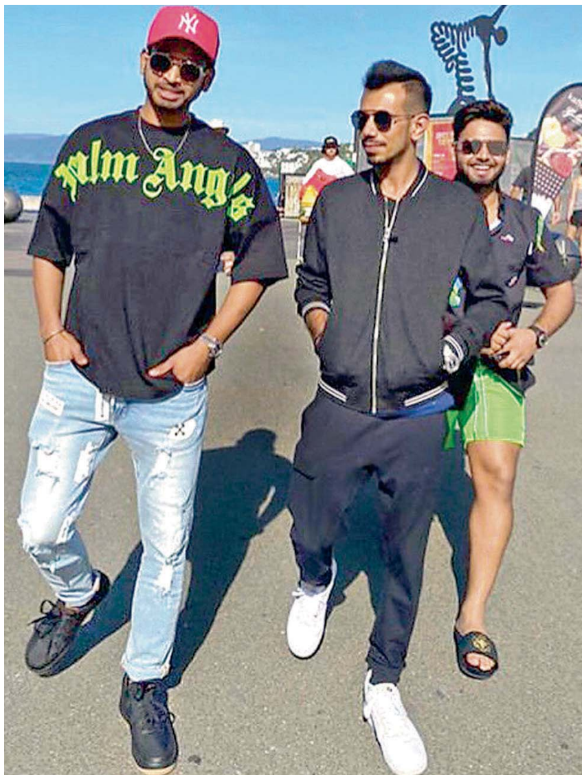
(from left) Shreyas Iyer, Yuzvendra Chahal and Rishabh Pant hang out in Wellington ahead of the fourth T20I against New Zealand.

Sanju Samson and Rishabh Pant are waiting for opportunities, with the former expected to get a look-in. Pant's call-up would depend on which batsman is left out, and whether KL Rahul will continue to keep wickets. While the top trio is assured of places, Shreyas Iyer has been in superb touch and can