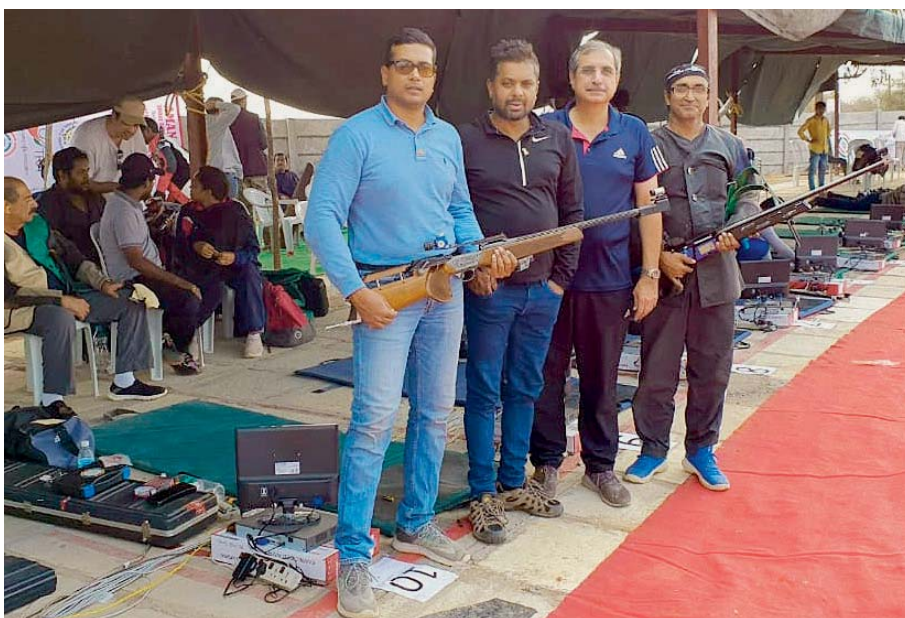
Officials pose at the Aman Sanghi shooting range in Sanghi Nagar after the inauguration of the Telangana State Shooting Competitions in Big Bore Events on Thursday.

With 14 games left, Liverpool's incredible run has given historic overtones.