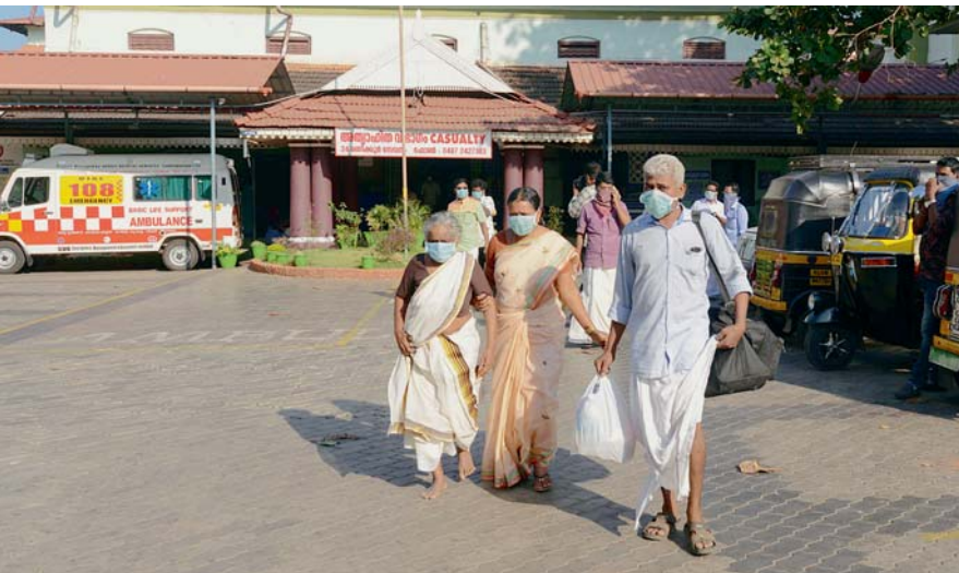
Indians wearing surgical masks walk out of the government general hospital where a student who had been in Wuhan is kept in isolation in Thrissur, Kerala.

The Chinese government has said it will cooperate with India to jointly