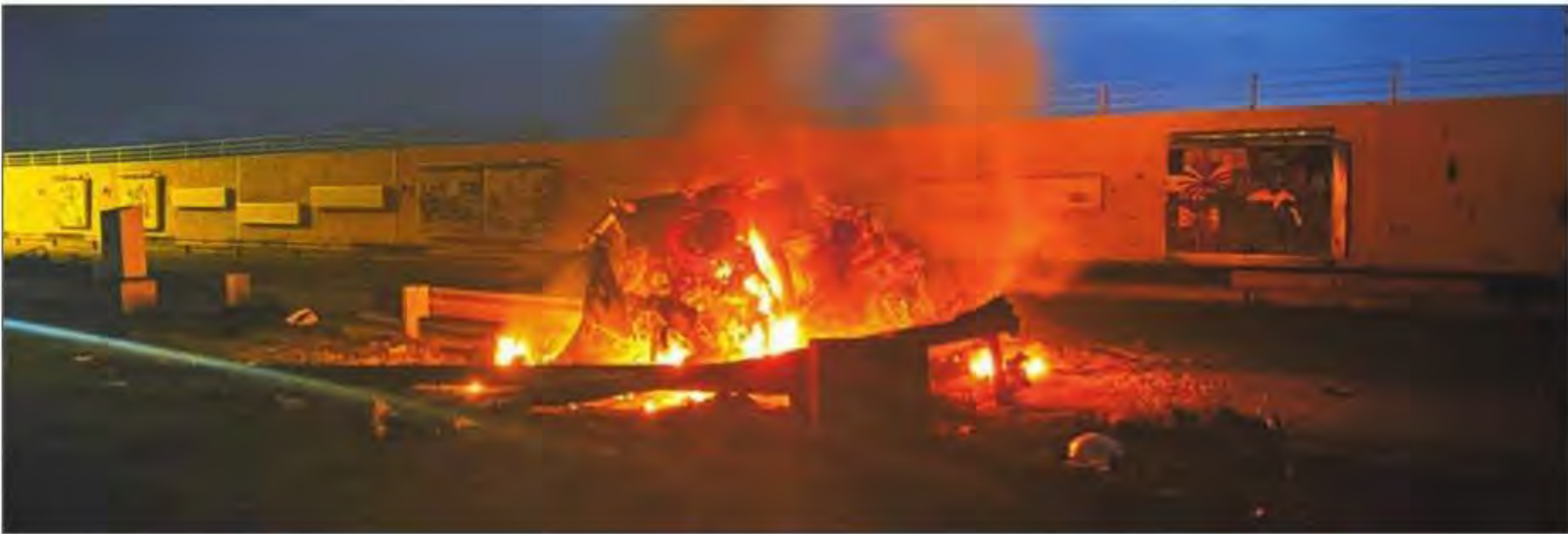
Photo released by the Iraqi Prime Minister's press office shows a burning vehicle at Baghdad airport, where Soleimani was killed in an airstrike early Friday.

THREE DAYS after the Kerala Assembly passed a resolution demanding scrapping of the Citizenship (Amendment) Act that will provide citizenship to non-Muslim refugees from Pakistan, Bangladesh and Afghanistan, Chief Minister Pinarayi Vijayan wrote letters