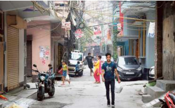
A view of an unauthorised colony in New Ashok Nagar.

At an event attended by Lieutenant-Governor Anil