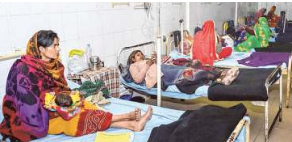
Awaiting relief: Sick children with their families at the government-run J.K. Lon Hospital in Kota on Friday.