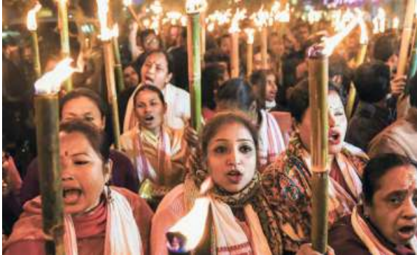
AASU activists participating in a torchlight rally in Guwahati on Friday against the amended Citizenship Act.