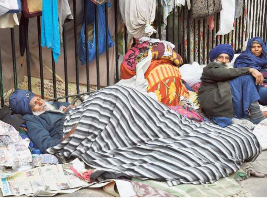
Pavement dwellers near Bangla Sahib Gurdwara in the city on a cold Friday morning. The minimum temperature on Friday settled at 7.6 degrees Celsius.