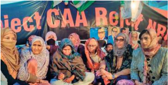
Women from Shaheen Bagh address a press conference on Friday.

The government is yet to announce the NRC but as per the rules inserted in 2003 to the Citizenship Act, 1955, the NRC will flow from data gathered under the NPR. The Ministry of Home Affairs maintains that individuals will not be asked to produce physical copies of different documents but that information provided by individuals will be accepted. As per the trial form prepared by the MHA, information will be collected across 21 parameters which include "place of birth of father and mother, the last place of residence", along with Aadhaar (optional), voter ID card, mobile phone and driving licence numbers.