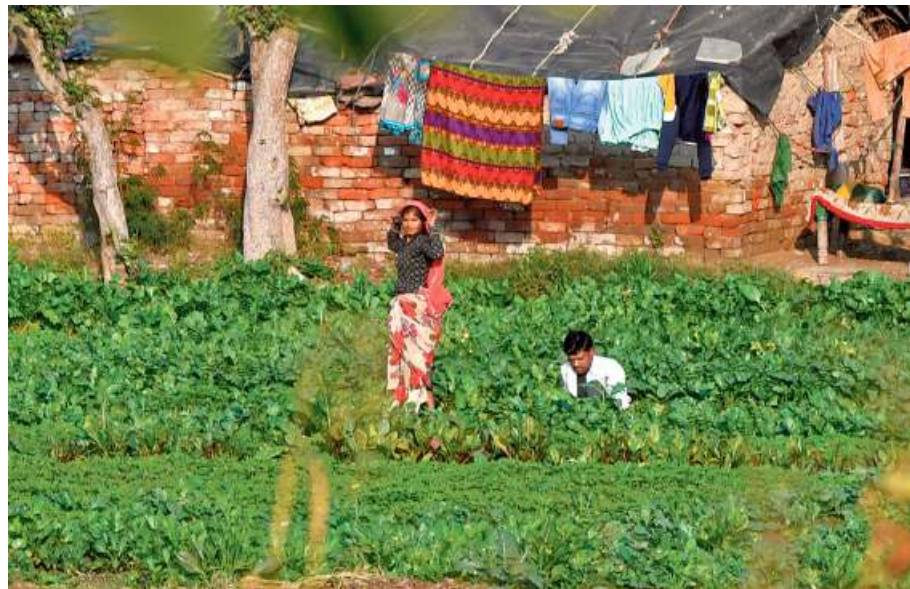
A field day: Farmers tend to their crop in New Delhi on Friday.