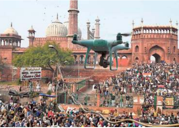
During the protests held in the city against the amended Citizenship Act, the police had hired drones at ₹4,000 per day.

Another officer, meanwhile, mentioned that he has also written for procure-