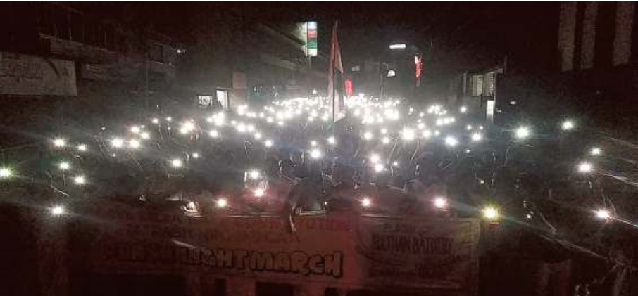
Youth power: A march organised by Flashlight of Sulthan Bathery, a collective of youth, against the Citizenship (Amendment) Act in Wayanad on Friday. •SPECIAL ARRANGEMENT

Like other democratic platforms, the Assembly had the right to respond when