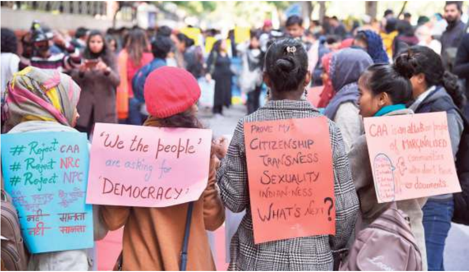
Protesters walk with placards during a stir against the CAA, NRC and NPR; (below) people from all genders, sexual and caste minorities gathered at Jantar Mantar on Friday.

Sex workers "The biggest problem for sex workers is to prove their work and the other is a lack of documents to prove their