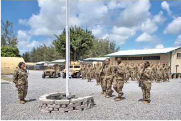
A file photo of U.S. troops at Camp Simba in Kenya.

'Aircraft, choppers & vehicles destroyed'