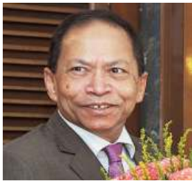
Surendra Kumar Sinha

Justice Sinha headed the South Asian nation's Supreme Court for a landmark