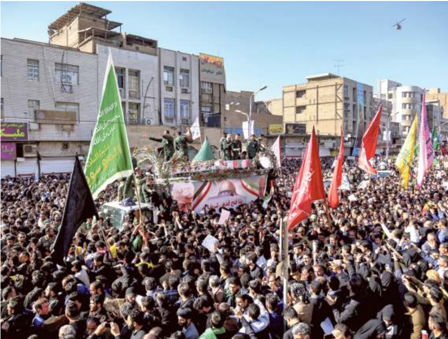
Tension escalates: A large crowd surrounding the coffin of slain top commander Qassem Soleimani during the funeral procession in southwestern city of Ahvaz, Iran, on Sunday.

Downplaying the comments, the U.S. Secretary of State Mike Pompeo has de-