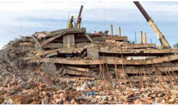
Mountain of rubble: Rescue personnel working at the site in Kep, where a building collapsed, on Sunday.

The 36 dead included six children and 14 women, officials said in a statement that did not detail why children were at the site.