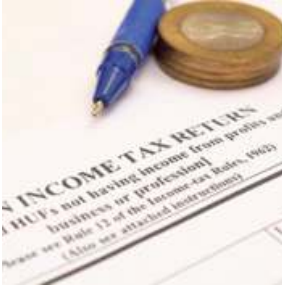
The forms for filing returns are usually notified in April every year.

As per the notification, returns in ITR-1 Sahaj can be filed by an ordinary resident individual whose total income does not exceed ₹50 lakh, while form ITR-4 Sahaj is meant for resident individuals, HUFs and firms (other than LLP) having a total income of up to ₹50 lakh and having presumptive income from business and profession.