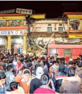
A part of the station's roof collapsed near the enquiry counter on Saturday.

The other injured person, who suffered a frac-