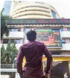
India was at 63 rd position for Ease of Doing Business across the world in 2019.

The presentation accessed by The Hindu lists five major threats to private investors in the country. The first is "increased frictional costs on capital mobility, including dividend distribution tax, buy-back tax and so on, which diminishes returns prospects," the association noted. A similar demand was recently made by