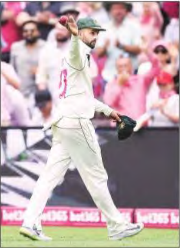
Nathan Lyon took five for 68.

Phillips, who only flew in on the eve of the Test as cover for a team weakened by a virus outbreak, was dropped twice and given a reprieve when caught off a no-ball. Lyon put down the two caught-and-bowled chances when Phillips was on two and 17. The Kiwi batsman dodged another bullet on 28 when he was caught by Travis Head at deep mid-wicket only to be recalled when James