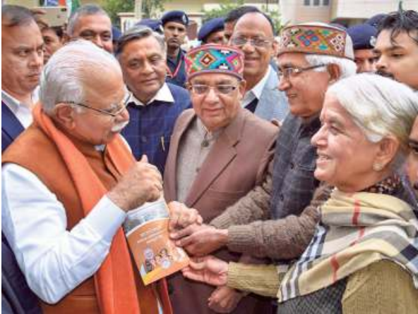
Haryana Chief Minister Manohar Lal Khattar during the 'Sampark Abhiyan' in Jalandhar on Sunday.

gated among the Muslims that it is a law to take away the citizenship of the country from them, whereas in reality, it is to give citizenship.