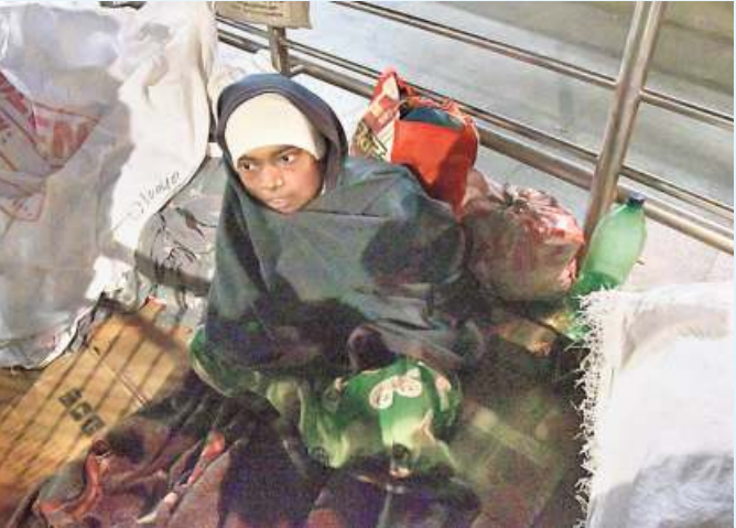
More than 100 people are sleeping outside AIIMS with flattened cardboard boxes doubling up as mattresses and a few with the luxury of plastic sheets as roofs.

through adversity, they said. "Hamare liye kya hai... kabhi zadda thand to kabhi zadda garmi... kabhi paani ko taraste hain to kabhi kambal ko [What about us... we bear with extreme cold and extreme hot... in one season we crave for water and in another, a blanket]," they said. The homeless people, said the nights are unbearable but blankets provided by temple officials and locals come in handy.