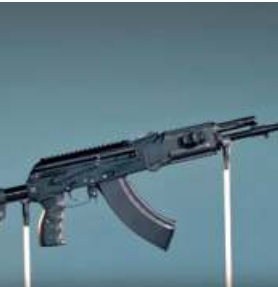
About 1 lakh rifles will be manufactured in Russia and the remaining in India.

They will be manufactured by an Indo-Russian joint venture