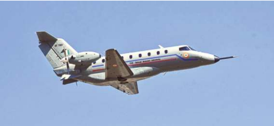
Taking wing: A Saras aircraft participating in the biennial AERO India show in February 2019. The 19-seater Mk2 will be the first indigenous light transport aircraft.

It says Centre should buy at least 50-60 Saras Mk2 aircraft to make production commercially viable