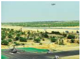
A view of the area where ISRO and DRDO facilities will be set up at Challakere.

K. Sivan, ISRO Chairman and Secretary, Department of Space, told The Hindu ,