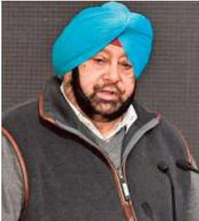
Amarinder Singh. •FILE PHOTO

The Chief Minister emphasised that the Indian go-