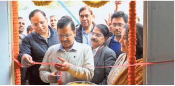
Chief Minister Arvind Kejriwal and others at the inauguration of a Mohalla Clinic.

“In Delhi, healthcare is completely free for all irrespective of rich or poor. Ayushman Bharat Yojana assures insurance for people, but those who own scooter, fridge, and cellphones and have an income of ₹10,000 are excluded. With these criteria applied, hardly anyone will be eligible for the scheme. Therefore, we have decided not to implement it,” Mr. Kerjiwal said. He ad-