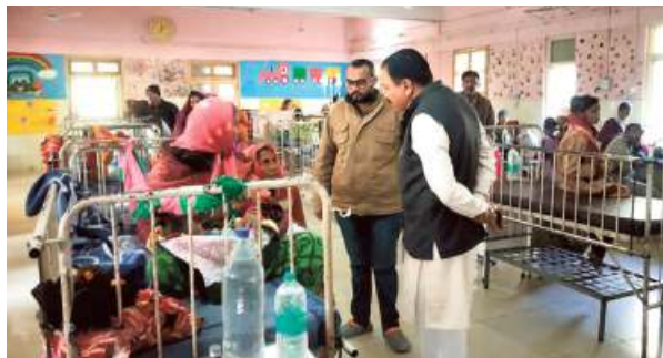
Worse outcomes: 1,235 infants died during 2019 at the Rajkot civil hospital. ■ SPECIAL ARRANGEMENT

dren were admitted and 85 lost their lives during treatment," Superintendent of Ahmedabad Civil Hospital G.S. Rathod said. At the Rajkot civil hospital, 1,235 infants died during 2019.