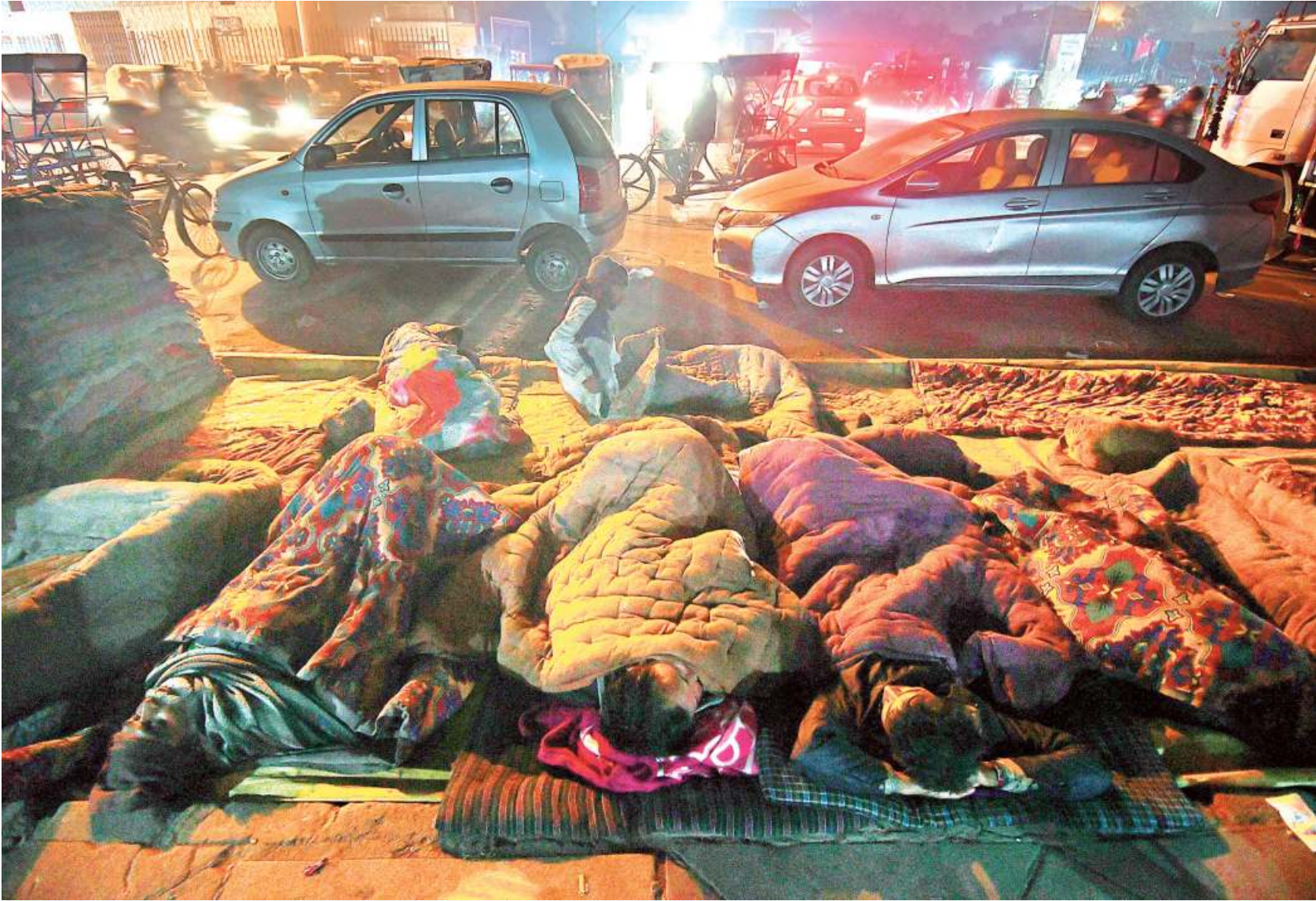
(Clockwise from top left) Homeless people sleeping on a pavement near Jama Masjid; a vendor waiting for customers at a makeshift shop in Old Delhi; people at a night shelter near Jama Masjid; patients taking a nap outside AIIMS; homeless people near AIIMS.