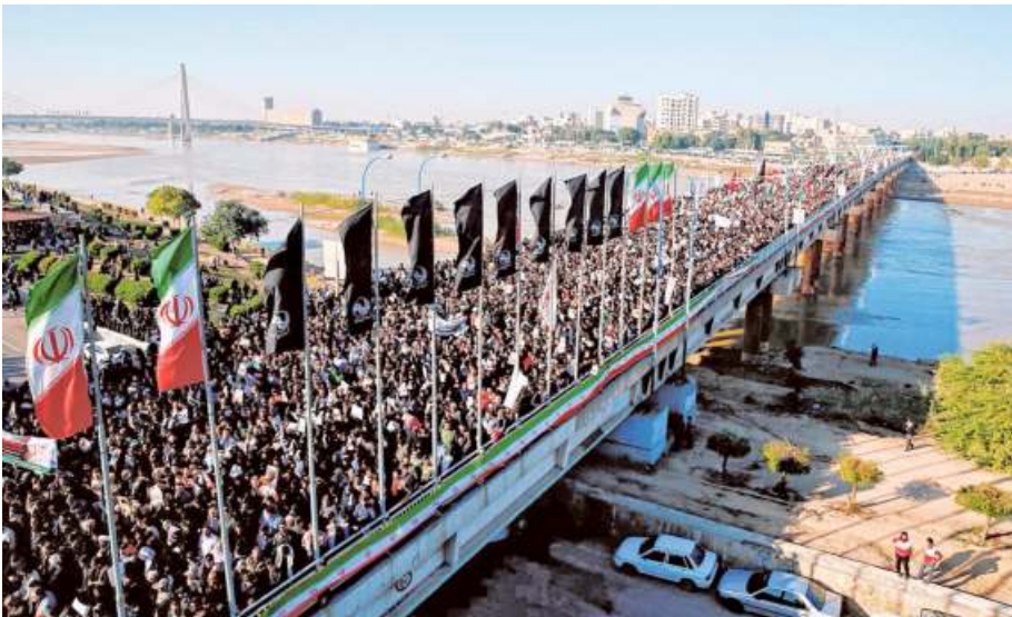
Paying their respects: People attending a funeral procession for Iranian Major-General Qassem Soleimani in Ahvaz, Iran, on Sunday.

Since the killings, rival Shia political leaders have called for U.S. troops to be expelled in an unusual show of unity among factions. "There is no need for the presence of American forces after defeating Da'esh (the Is-