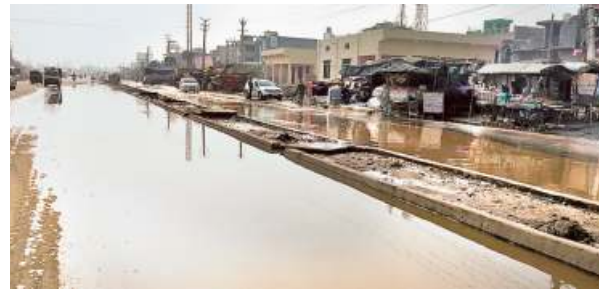
The flooded road on Delhi-Agra highway near Seekri village.

Running a kiosk off the highway for over a decade, Majlis from Nuh, said the sewage from the village earlier flowed down a drain. However, the trouble began six months back when the highway was widened to six-lanes and a service road was constructed over the drain, he said.