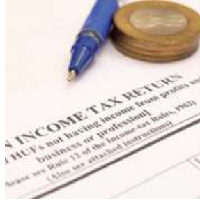
The forms for filing returns are usually notified in April every year.

As per the notification, returns in ITR-1 Sahaj can be filed by an ordinary resident individual whose total income does not exceed ₹50 lakh, while form ITR-4 Sahaj is meant for resident individuals, HUFs and firms (other than LLP) having a total income of up to ₹50 lakh and having presumptive income from business and profession.