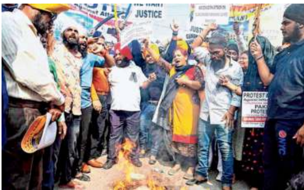
Seeking action: Sikhs in Hyderabad staging a protest against the attack on Gurudwara Nankana Sahib in Pakistan.

"India strongly condemns the targeted killing of a minority Sikh community member in Peshawar that follows the recent despicable vandalism and desecration of the holy Gurudwara Sri Janam Asthan at Nankana Sahib. The Government of