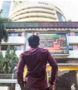
India was at 63 rd position for Ease of Doing Business across the world in 2019.

The presentation accessed by The Hindu lists five major threats to private investors in the country. The first is "increased frictional costs on capital mobility, including dividend distribution tax, buy-back tax and so on, which diminishes returns prospects," the association noted. A similar demand was recently made by