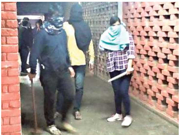
Masked persons armed with sticks roaming around the JNU campus.

"Professors who were trying to protect us have been beaten up. These are unknown ABVP goons, not all are students, they have covered their faces, and are moving towards the...West