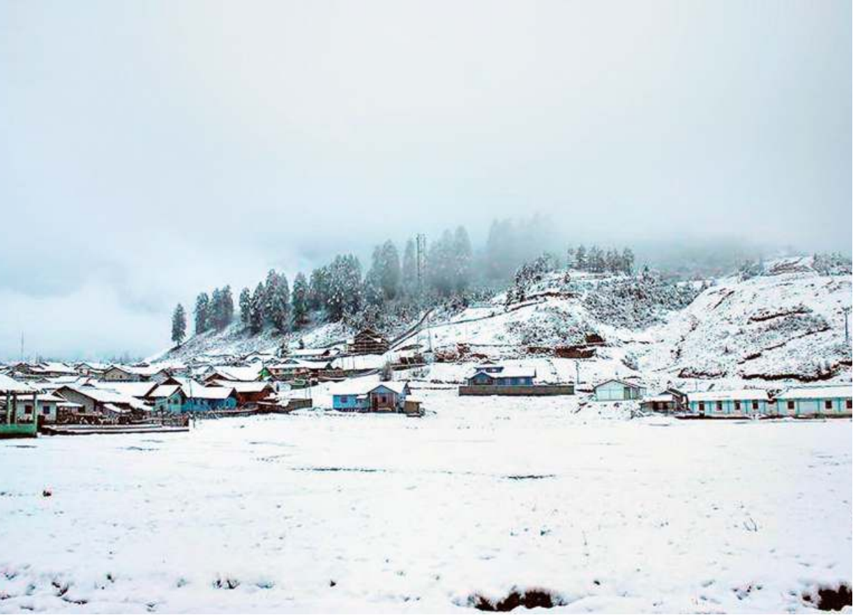
A view of snow-covered Mechuka following heavy snowfall in Shi-Yomi district of Arunachal Pradesh on Sunday.