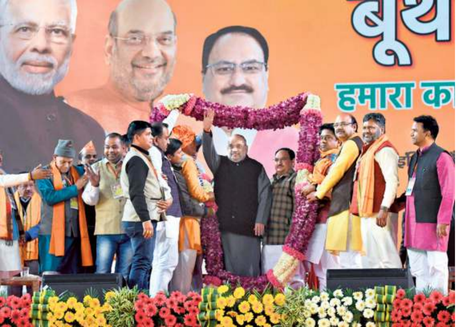
Senior BJP leaders Amit Shah and J.P. Nadda at a rally of booth-level workers in New Delhi on Sunday.

Mr. Shah attacked the Kejriwal government on multiple fronts, saying that the Aam Admi Party (AAP) had managed to fool the people of Delhi once during the 2015 Assembly elections, but were wiped out in the subse-