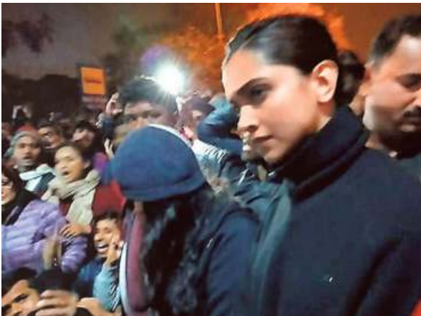
Supportive role: Bollywood actor Deepika Padukone visiting JNU to show solidarity with the students on Tuesday.