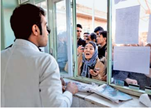
Tense moments: A woman enquiring about her brother outside the information office of a hospital in Kerman on Tuesday.

The streets of Kerman overflowed with mourners, while others took refuge on hillsides around the city, where the General was to be buried at the martyrs' cemetery.