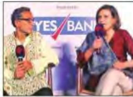
Banerjee and Dufflo

Close to tipping point of major recession, says Banerjee