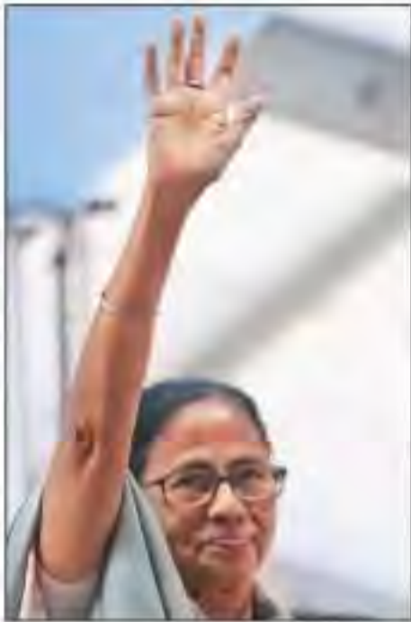
At Patharpratima, South 24 Parganas, Tuesday

Mamata on NPR: When enumerators come, don't give any info