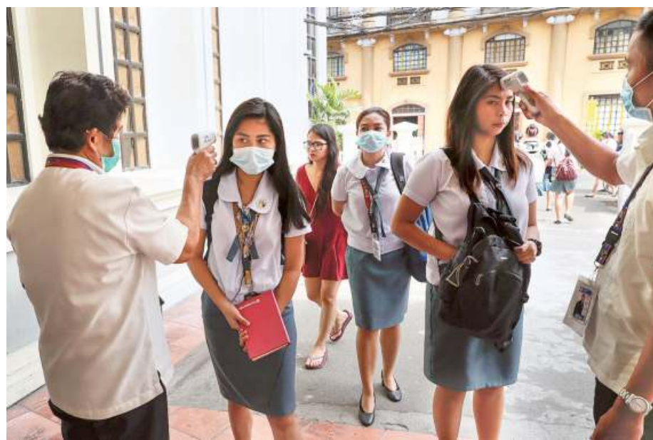
Precautionary measure: Health workers using thermal scanners to check the temperature of students at a school in Manila, the Philippines, on Friday.

The roughly 60 million residents of Hubei province, where Wuhan is the capital,