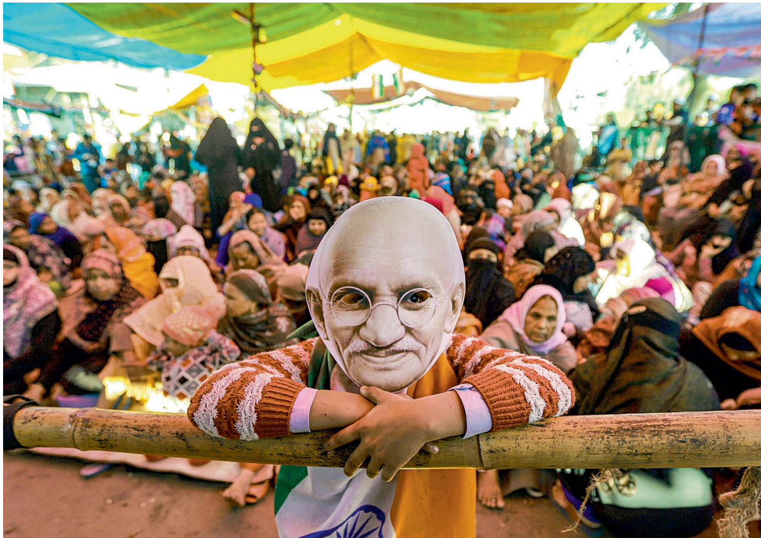
A child wears a Mahatma Gandhi mask during the ongoing protest against the Citizenship Amendment Act and National Register of Citizens at Shaheen Bagh in New Delhi on Friday.