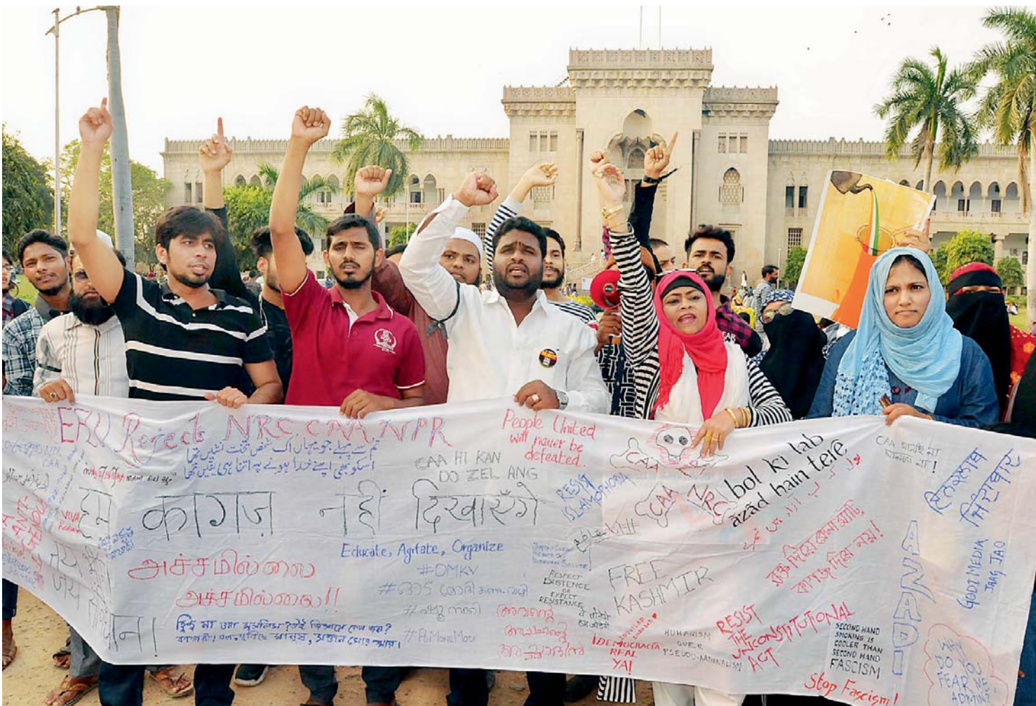
Students from different universities protest at OU Arts college against CAA.