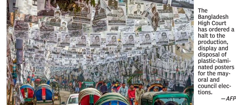
The Bangladesh High Court has ordered a halt to the production, display and disposal of plastic-laminated posters for the mayoral and council elections.