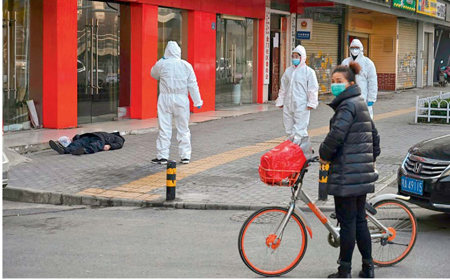
A man wearing a face mask lies dead on the pavement at ground zero of China's virus epidemic, a plastic shopping bag in one hand.

Some countries banned entry for travellers from Wuhan, the city in central Hubei province where the virus first surfaced. Italy, which has stopped all flights to and from China, declared a state of emergency on Friday to fast-track efforts to prevent the spread of the virus. In Bangladesh's biggest airport, workers held up digital thermometers to passengers' heads. A beeping alarm sounded as a passenger walking through a thermal scanner registered a fever. — Agencies