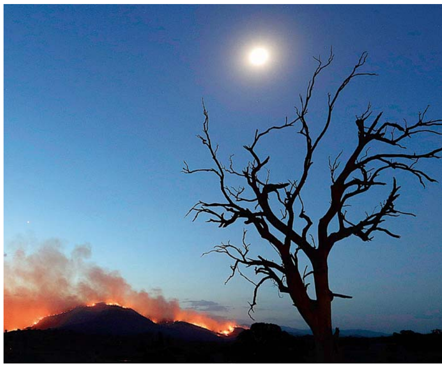
A wildfire glows on the hills near Clear Range, south of the Australian capital Canberra on Friday.

Canberra, Jan. 31: The Australian capital region declared a state of emergency on Friday because of an out-of-control forest fire burning erratically to its south. It's the first fire emergency for the Australian Capital Territory area since 2003 when wildfires killed four people and destroyed almost 500 homes in a single day. The threat is posed by a blaze on Canberra's southern fringe that has razed more than 21,500 hectares (53,000 acres) since it was sparked by heat from a military helicopter landing light on Monday, the Emergency Services Agency said. "The state of emergency sets a clear expectation for our community that we need you to be vigilant," Emergency Services Minister Mick Gentleman told reporters. "This is the worst bushfire season in the ACT since 2003."