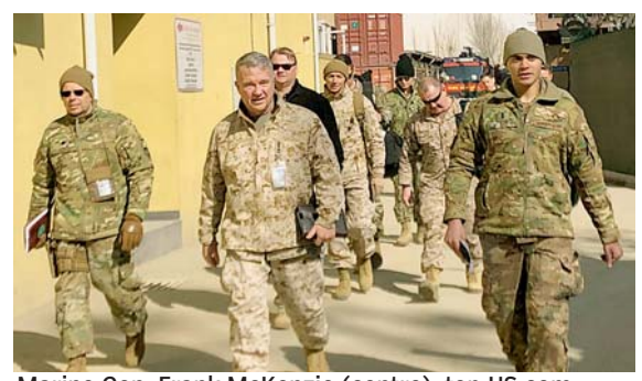
Marine Gen. Frank McKenzie (centre), top US commander for the Middle East, makes an unannounced visit, in Kabul on Friday. — AP

country in 2005. Even as the international community is paying billions of dollars annually, the poverty rate in Afghanistan is climbing. In 2012, 37 per cent of Afghans were listed below the poverty rate, surviving on less than USD 1 a day. Today that figure has risen to 55 per cent of Afghans. The United States is paying USD 4.2 billion yearly just for Afghanistan's security and defense forces. —AFP