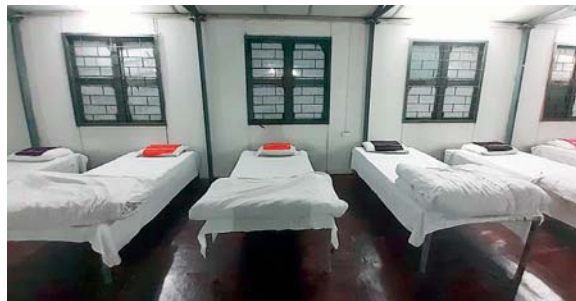
The Army's quarantine facility at Manesar.