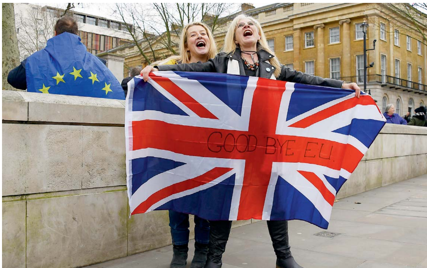
Brexit supporters hold the Union Jack with a text reading 'Goodbye EU' next to a man wearing the EU flag in London on Friday.

London, Jan. 31: Britain's exit from the EU is not an end but a new beginning, according to Prime Minister Boris Johnson who is set to deliver a message of unity to mark Brexit Day on Friday when the country finally leaves the bloc, over three years after the landmark Brexit vote. In a video message recorded in Downing Street on Thursday and to be aired at 22:00 GMT on Friday, an hour ahead of the UK's scheduled exit time, the Conservative Party leader who took charge as UK prime minister last year with a "do or die" Brexit pledge will characterise the historic moment as a new beginning for the country. "This is the moment when the dawn breaks and the curtain goes up on a new act. It is a moment of real national renewal and change," Downing Street said in a read-out of Johnson's address to the nation. "Our job as the government - my job - is to bring this country together and take us forward. And the most important thing to say tonight is that this is not an end but a beginning," it reads.