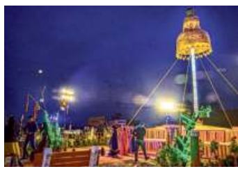
A view of the 20ft high dangler, 'Bareilly ka Jhumka.'

Jhumka and Bareilly became synonymous after a 1966 chart-buster on the jewellery in which actor Sadhana gave a feisty dance performance. The city has finally got a fanciful 14-ft 'jhumka', embellished with colourful stones and the city's famous 'zari' embroidery, installed and is expected to be a major attraction for visitors.