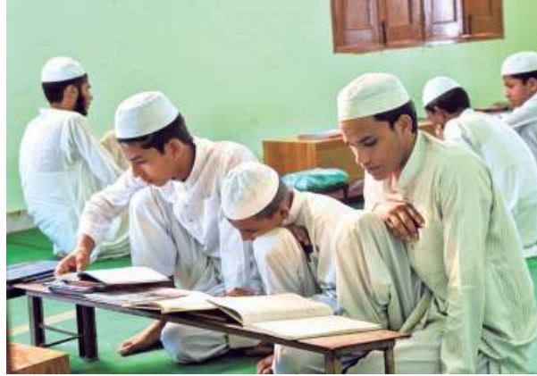
More takers: The Madrasah education follows the Secondary Education Board's syllabus almost entirely. ■ R.V. MOORTHY

"In the past couple of years, we are witnessing a 2%-3% rise in the number of students appearing for the examination," he said. But the figure usually comes