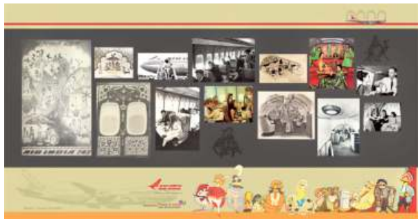
Glimpse of the past: There will be 125 panels displaying Air India's archived photographs.