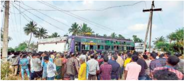
Fatal shock: The bus which caught fire after coming into contact with a power cable in Ganjam district on Sunday.

Around 45 passengers in the bus were travelling from Dankalpadu village to Chikarada to attend a pre-wedding function. The groom was travelling in a car. While proceeding on the Golanthara-Tulu road, the metal goods