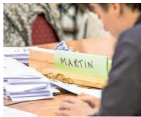
Counting of votes underway at Nemo Rangers GAA club in Cork, southern Ireland.

In a major realignment, Sinn Fein support surged 50% to bring it into joint first place on 22% with Fine Gael and Fianna Fail, the two centre-right parties that have dominated Irish politics for a century, according to the poll released on Satur-