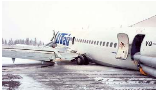
Hard landing: The passenger plane that was involved in the hard landing at Usinsk airport on Sunday.

None of the 94 passengers or six crew members were badly injured, the airline said, adding, however, that