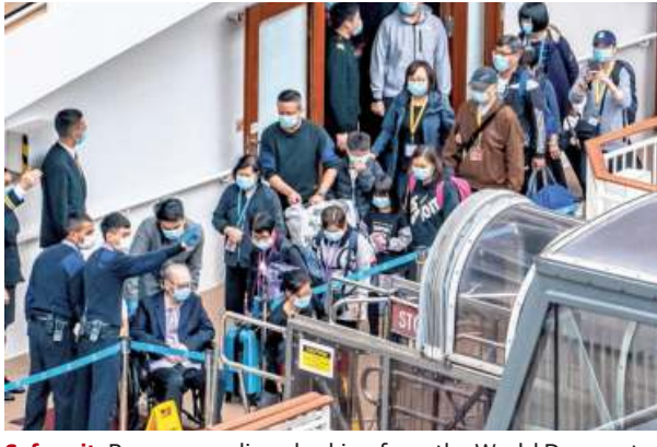
Safe exit: Passengers disembarking from the World Dream at Kai Tak Terminal, Hong Kong, on Sunday.

First found in the city of Wuhan in central China last