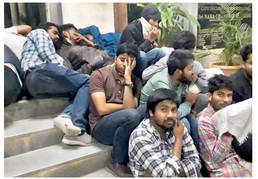
Youth after being detained at the Goshamahal Police Station for participating in the flash protest at Mallepally try to sleep on the footsteps.