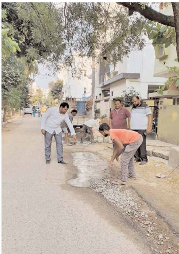
Residents repairing the road in the Secunderabad Cantonment as the board has said it has no money.