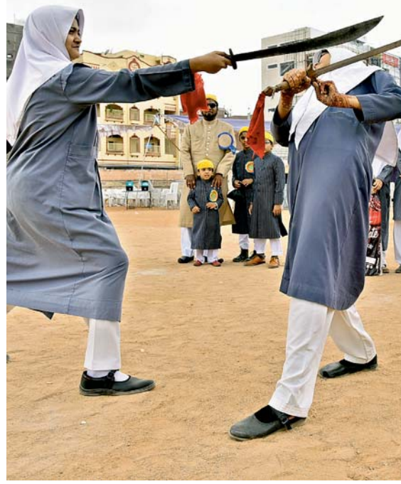
Students perform marital arts during the Deeni Taleem Rally at Quli Qutb Shah Stadium on Sunday.