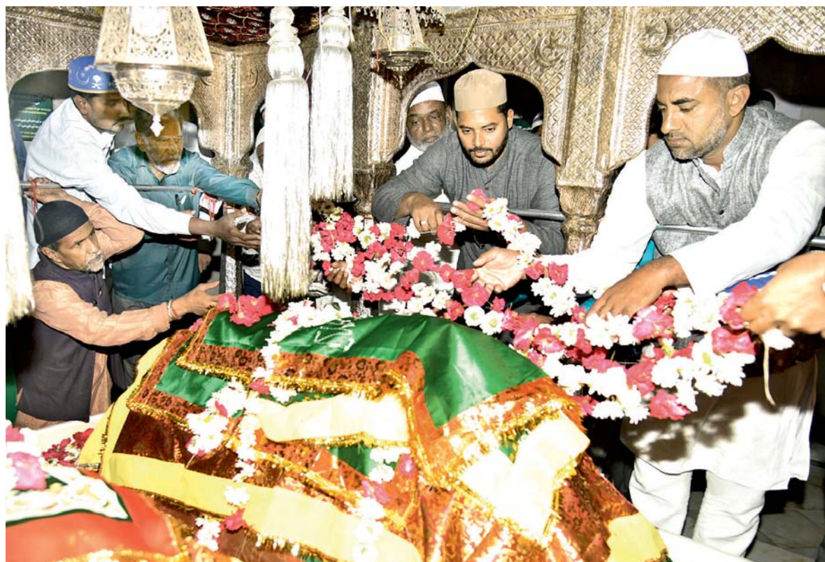
Hyderabad-based AAP party members offer a chaddar at the Dargah-e-Yousufain in Nampally on Sunday to pray for the victory of their party's candidates in the Assembly elections in Delhi.