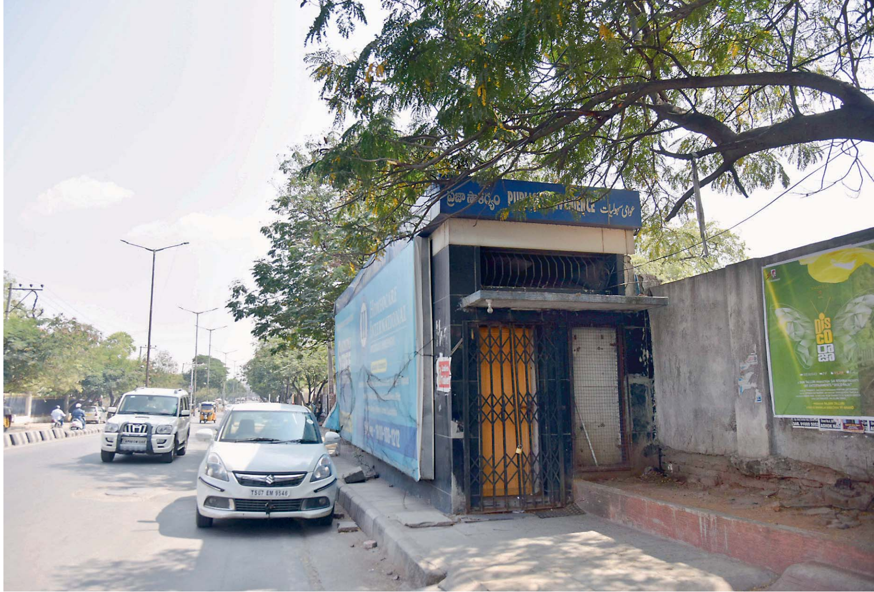
A toilet for women has been kept under lock at Seethaphalmandi. The toilet which was opened amidst much fanfare during the GHMC's Swachh Survekshan campaign, have become unusable due to improper maintenance. However, nearby private toilets which are collecting a nominal fee are functioning normally.