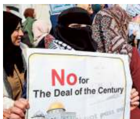
A demonstration in Gaza City on Monday.

Then the three Palestinians were returned to their Israeli interrogators. They had been swept up in a sprawling manhunt launched after a roadside bomb killed a 17-year-old Israeli girl and wounded her father and brother as they hiked down to a spring last August in the occupied West Bank. Israeli and Palestinian rights groups say there is