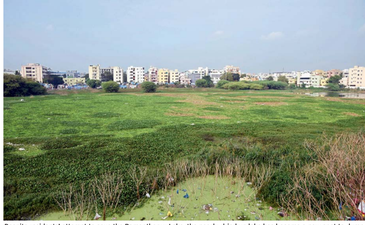
Despite residents' attempt to save the Ramanthapur Lake, the nearly-dried up lake has become a new spot to dump garbage for nearby traders