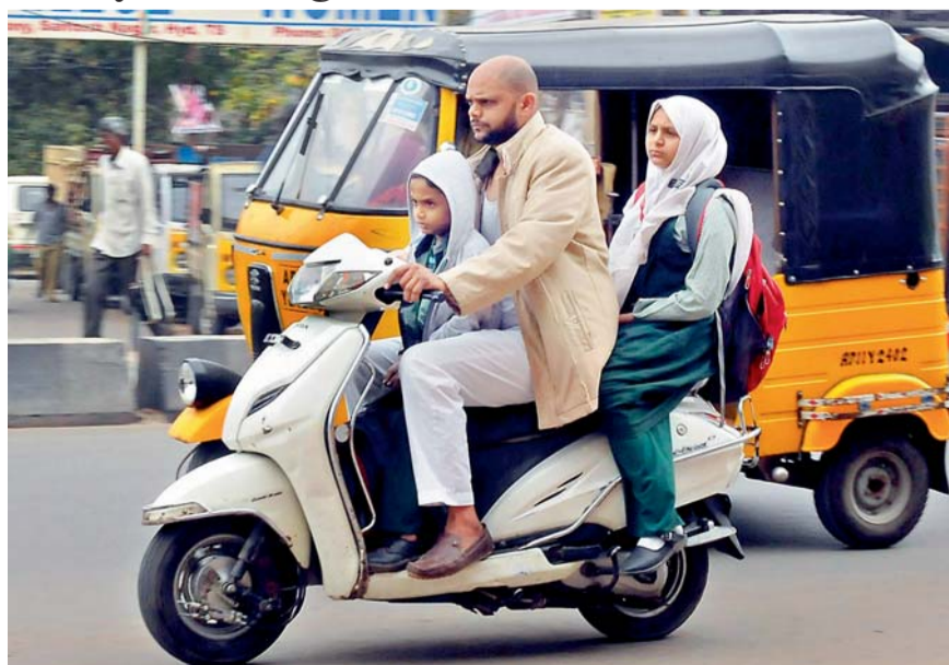
Following the dip in temperatures over the weekend, children are seen with warm clothes their to school on Monday morning.