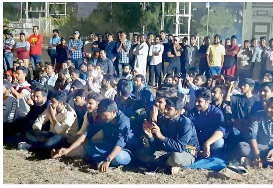
Maulana Azad National Urdu University students organise a protest against CAA, NRC and NPR inside the campus

She said the fight against CAA, NPR and NRC is not a struggle of only Muslims as other communities will also be affected once NRC is implemented.