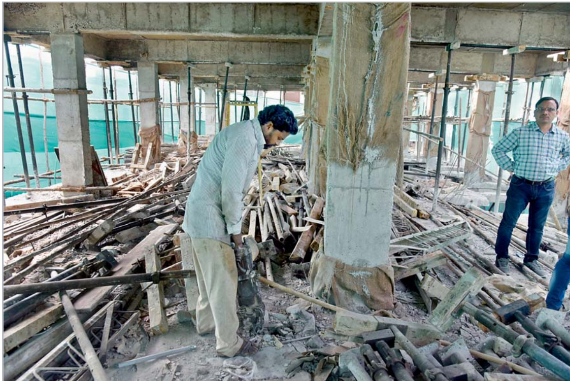
Illegal building constructed on the premises of City Light hotel on the RP road being demolished by GHMC officials on Monday.