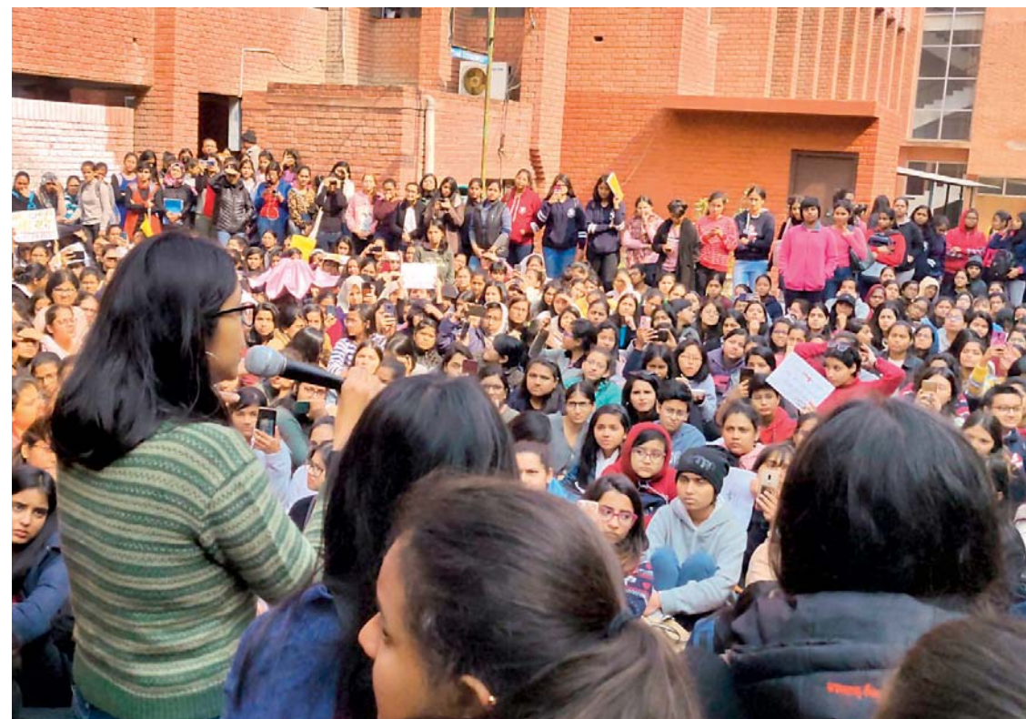
Delhi Commission For Women chief Swati Malwal (in green sweater) addresses students during a protest at Gargi College in New Delhi on Monday. —PTI

They also alleged that Rapid Action Force and Delhi Police personnel were deployed close to the gate from where the men entered the college, but they did nothing to control the unruly crowd. "There was a complete lapse of security. The students were groped, molested and even assaulted by the men who