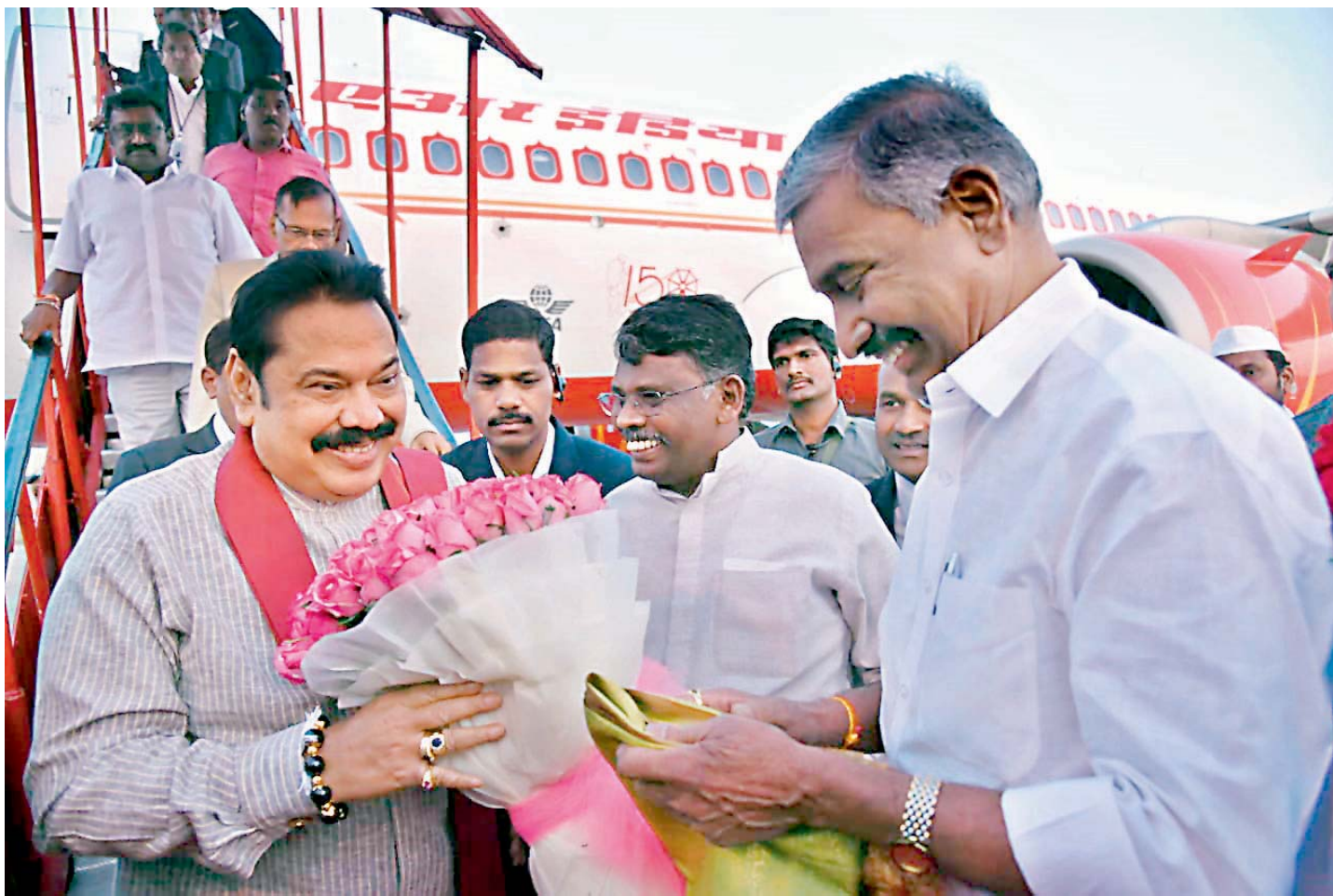
Sri Lankan Prime Minister Mahinda Rajapaksa is received on his arrival at the Sri Padmavathi guest house in Tirumala on Monday. Mr Mahinda, who is on a five-day visit to India, will offer worship at the Lord Balaji temple on Tuesday.