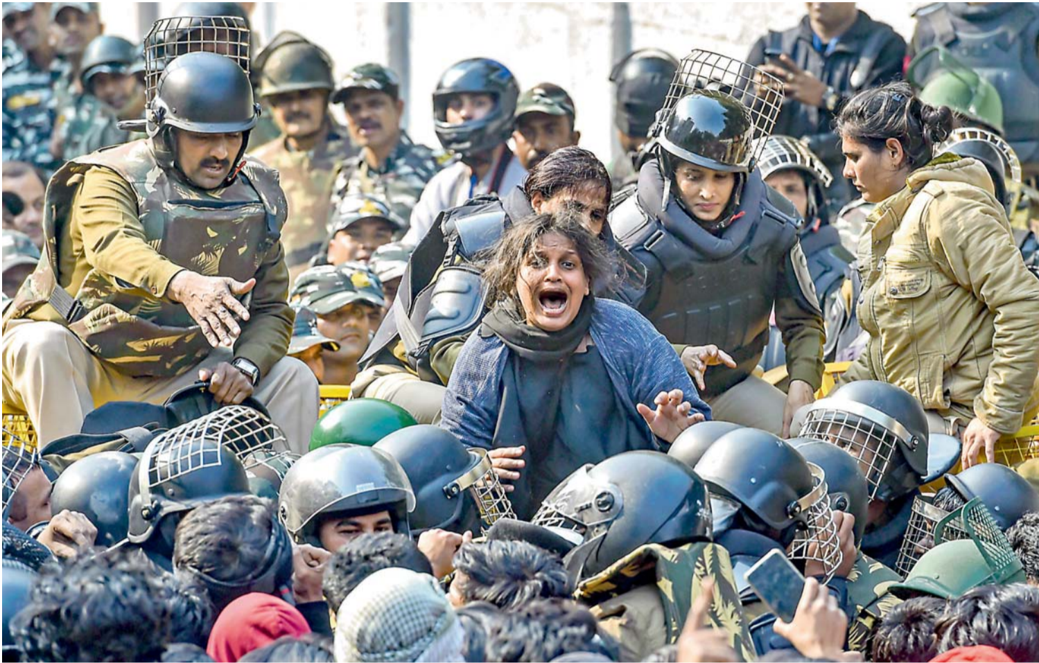
A woman protester shouts as police stop her and several others during their march against the amended Citizenship Act, NRC and NPR, near Jamia Nagar in New Delhi on Monday.

Vol. 83 No. 41 Established 1938 | 32 PAGES | ₹6.00