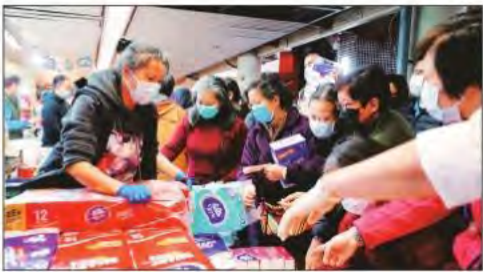
At a market in Hong Kong on Tuesday.

The government's top medical adviser on the outbreak, Zhong Nanshan, held out hope that the epidemic may peak in February and then plateau before easing. "The peak time may be reached at the... middle or late this month," Zhong, an epidemiologist who won fame for his role in combating an outbreak of Severe Acute Respiratory Syndrome in 2003, told. The number of new cases was already declining in some provinces, he added. The National Health Commission said earlier another 108 people had died on Tuesday, a daily record, taking to 1,016 the total of those killed in China. All but five of the deaths were in the central province of Hubei, the epicentre of the outbreak. There were 2,478 new confirmed cases on the mainland by Monday, down from 3,062 the previous day, bringing the total to 42,638. It was the second time in