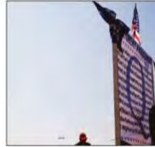
A rally for QAnon in Washington last year.

a Tampa, Florida, park to listen to speakers and pick up literature, and in England, a supporter of President Donald Trump and Brexit leader Nigel Farage raised a "Q" flag over a Cornish castle. Most recently, the botched Iowa Democratic caucuses and the coronavirus outbreak have provided fodder for conspiracy mongering: QAnon fans shared groundless theories online linking liberal billionaire George Soros to technological problems that hobbled the caucuses, and passed around bogus and potentially dangerous "treatments" for the virus. About a dozen candidates for