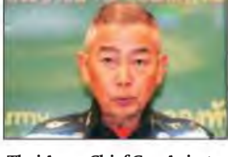
Thai Army Chief Gen Apirat Kongsompong at a press conference in Bangkok.

in Iowa could severely damage progressive rival Senator Elizabeth Warren, who faced the prospect of an embarrassing defeat in a state that borders her home of Massachusetts. While Sanders marches forward, moderates are struggling to unite behind a candidate. After essentially tying with Sanders for first place in Iowa, Pete Buttigieg, the 38-year-old former mayor of South Bend, Indiana, began his day as the centrist front-runner. AP