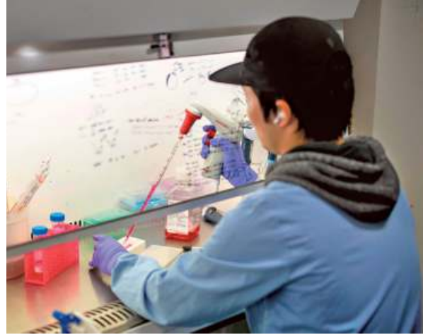
Fighting back: A researcher working on a vaccine for COVID-19, at the Imperial College School of Medicine, London.

The World Health Organization (WHO) said on Tuesday 1,017 people had died in