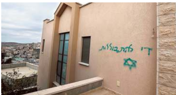
Hate crime: A building on which slogans were sprayed overnight in the northern Israeli Arab village of Jish.

The tyres of over 150 cars were punctured, Jish council head Elias Elias said, adding