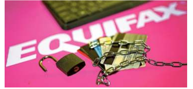
Data breach: U.S. accused China of stealing consumer data of some 145 million Americans.

Mr. Geng also turned the accusation back on the U.S.,