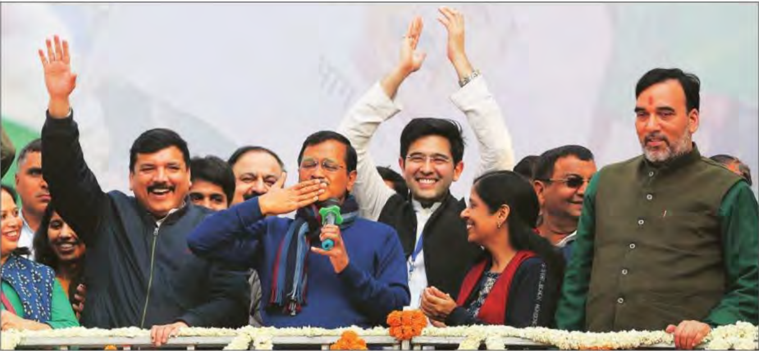
Delhi Chief Minister Arvind Kejriwal with his family and party leaders at the AAP headquarters in New Delhi on Tuesday.