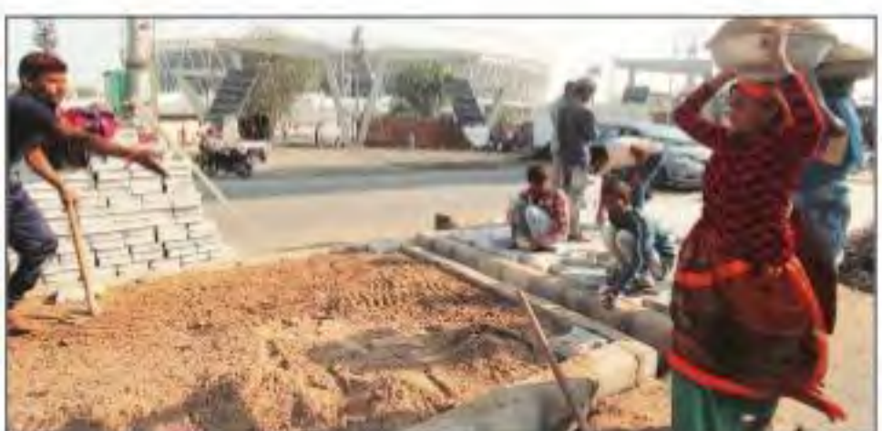
Beautification work near the Motera stadium.