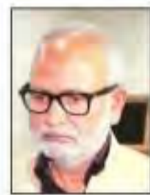
Geelani never gave up dream of education, he told teachers

ADVISING PEOPLE to read Hurriyat leader Syed Ali Geelani's autobiography to inspire them to "never give up the dream of education" and criticising the then BJP president Amit Shah's speech are among the reasons cited by the Jammu and Kashmir (J&K) administration for invoking the stringent Public Safety Act (PSA) against senior