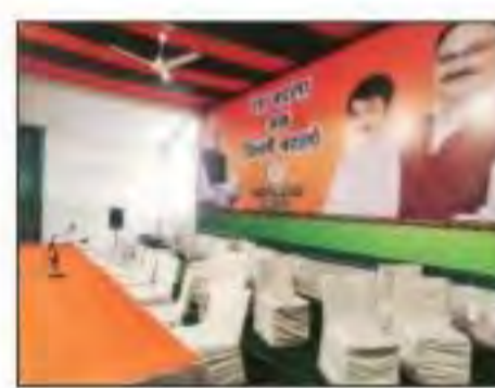
The BJP office in New Delhi on Tuesday. Abhinav Saha

Indeed, the BJP, which had secured majority in 65 of the 70 Assembly seats in the Lok Sabha elections in Delhi nine months ago, was optimistic