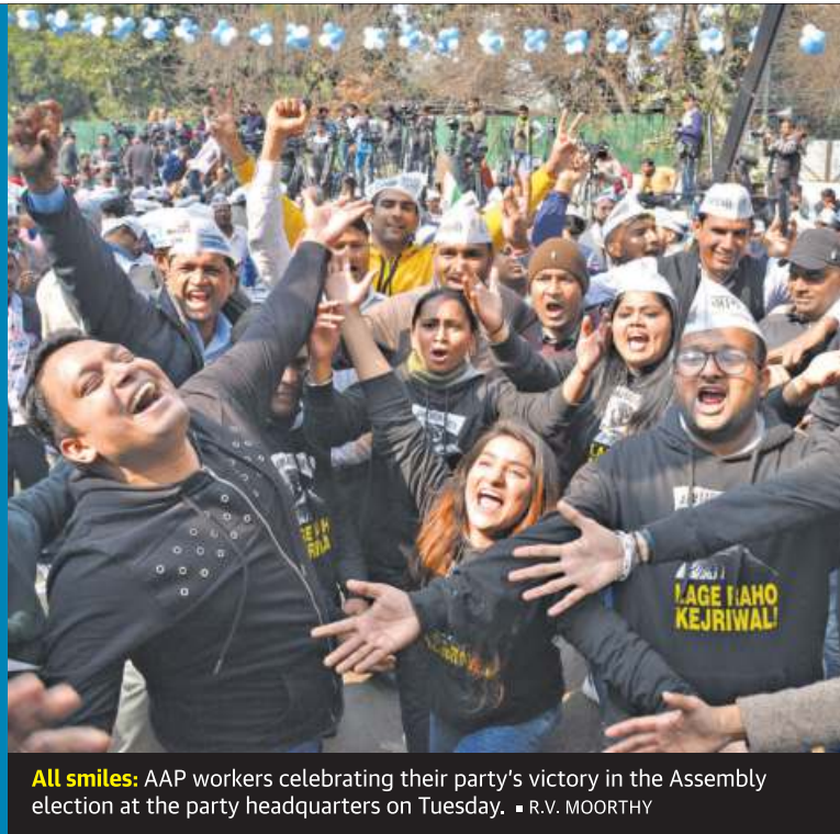
All smiles: AAP workers celebrating their party's victory in the Assembly election at the party headquarters on Tuesday. • R.V. MOORTHY