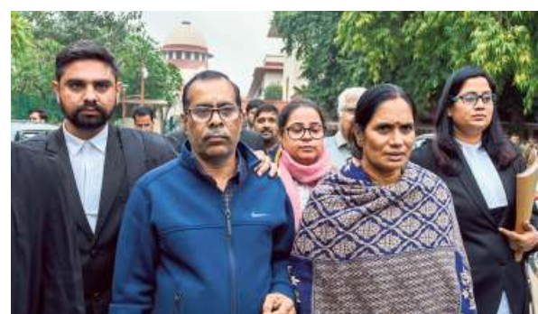
Steel will: The parents of the Nirbhaya rape case victim outside the Supreme Court in New Delhi in December.