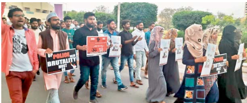
People take out a rally condemning police brutality on Jamia students — DC

Unani students of UG and PG courses boycotted classes at the Nizamia Tibbi College in solidarity with the students of Jamia Millia Islamia who were beaten up by the Delhi police when they tried to march towards Parliament. The Nizamia students took out a protest march raising slogans against the Delhi police and condemned the police. Women students said that the Delhi police crossed all limits and brutally attacked even