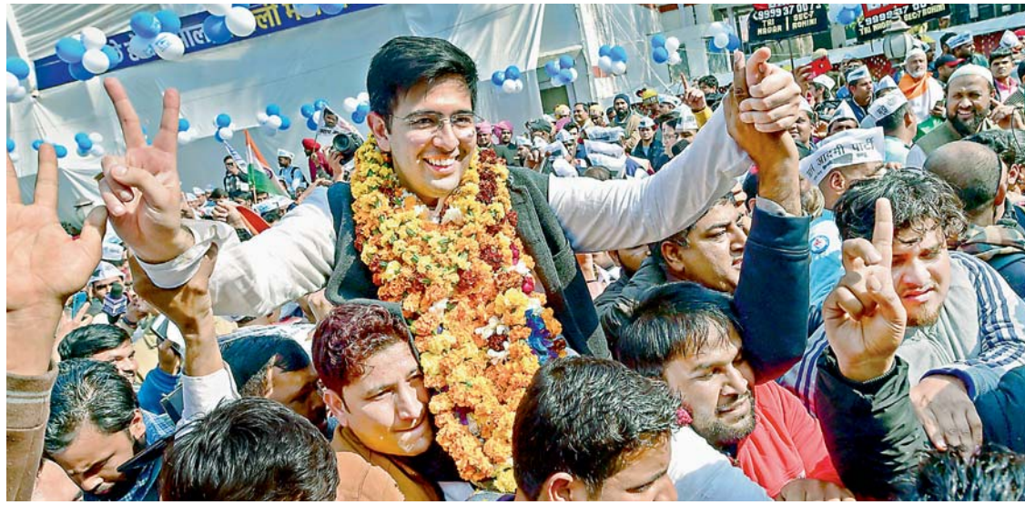
Aam Aadmi Party (AAP) leader Raghav Chadha displays victory sign following party's win in the Delhi Assembly elections, at party office in New Delhi on Tuesday.