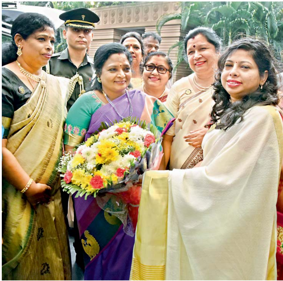
Governor Dr Tamilisai Soundararajan is greeted by the organisers of the Forum of Women in Public Sector who celebrated their 30th national meet in Hyderabad on Tuesday. The topic of discussion was 'power to transform - decision to action'.