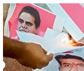
Osmania University students burn an effigy of minister K.T. Rama Rao.