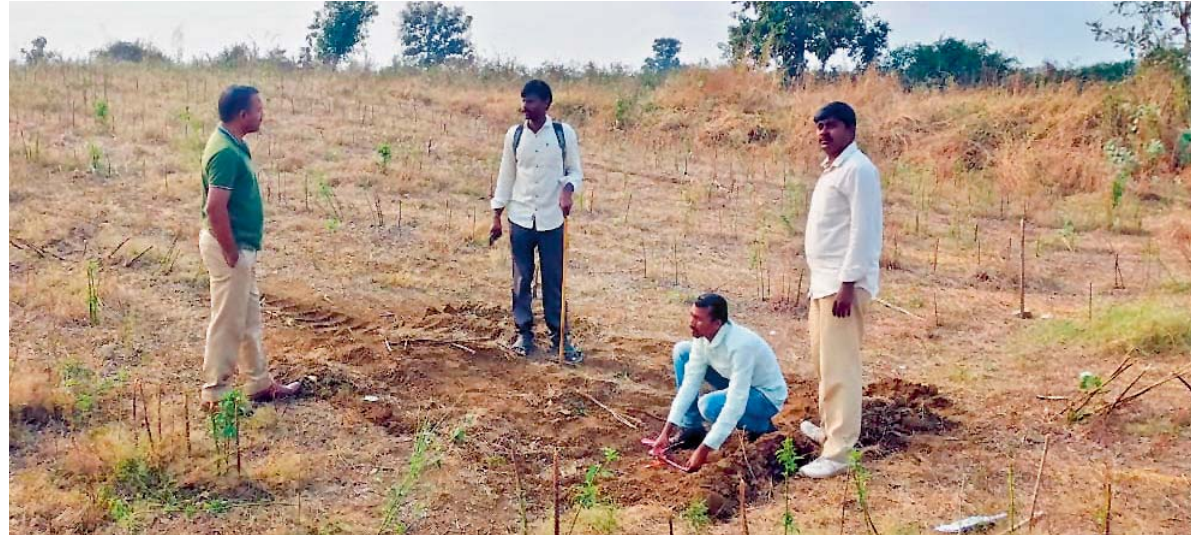
Forest officials measure the pugmark of the tiger that has strayed into the forest of Adilabad

An Adilabad forest officer said that the tiger had strayed recently into the forests of Bheempur mandal, crossing the river Penganga. It is said that the tiger has travelled some 70 km to reach the Bajharhathnoor forest area overnight.