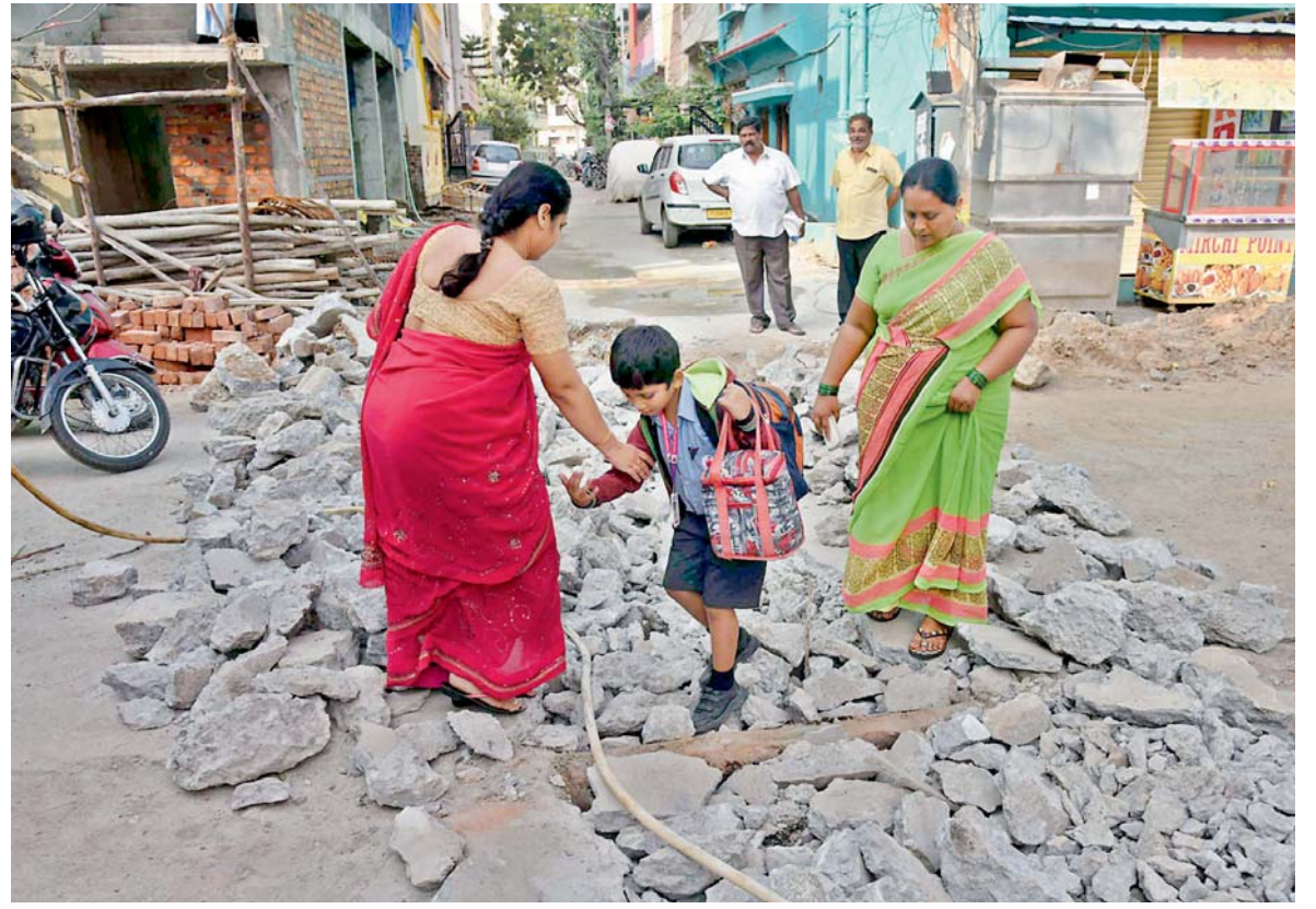
A child takes help of his parent to cross the dug up roads around Raghavendranagar as vehicles cant reach their residence. The civic body has dug up the roads to lay drainage pipes.