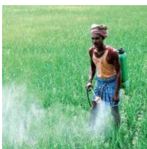
The draft Bill had proposed raising penalty on sellers of spurious pesticides.

In February 2018, the Centre released a draft of the pesticides Bill that aims to re-