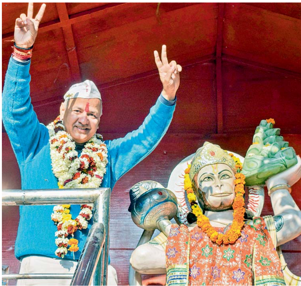
AAP leader Manish Sisodia during the Dhanywad Yatra in Patparganj after winning the Delhi Assembly Elections in New Delhi on Wednesday.

Many people are being questioned and multiple suspects have been identified, the police said. The Delhi Police on February 10 registered a case in connection with the incident. A group of men had broken into the institute during the 'Riviera' fest on February 6 and allegedly groped, harassed and molested the attendees.