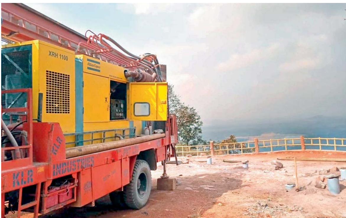
Tourism Department began construction of the cantilevered platform at Farhabad Viewpoint a few days ago. — DC

The Supreme Court has made it clear that "no new