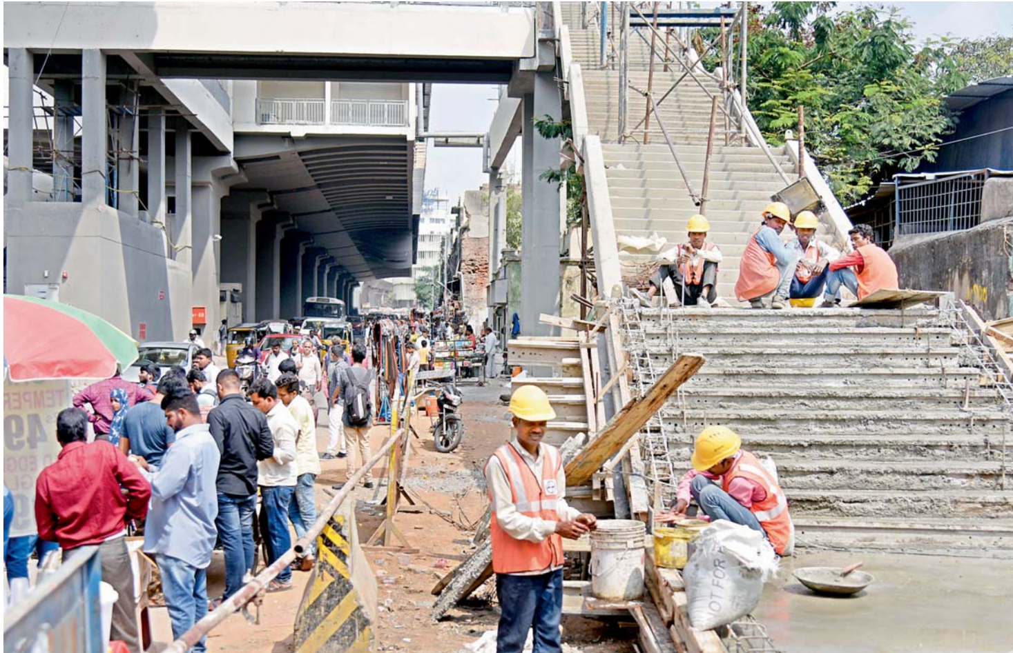
Works go on at the Sultan Bazaar Metro station which falls in the JBS-MGBS corridor which was inaugurated by Chief Minister K. Chandrababu Naidu last week.