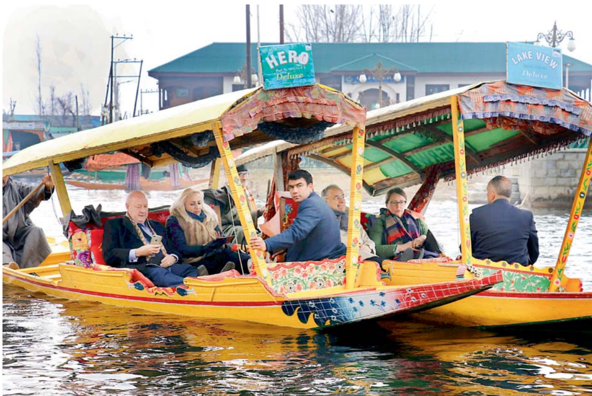
A delegation of 25 European Union Parliamentarians enjoys a Shikara ride at Dal Lake on Wednesday during their visit to Srinagar to assess the ground situation in the Kashmir valley.