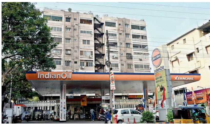
Petrol bunk situated within 50 feet of residential area on S.D. Road.

"The PGAB team is doing a wonderful job and this is evident by the increase in the number of placements," the PGAB chairman said.