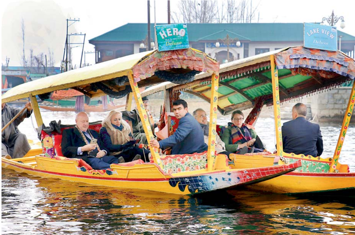
A delegation of 25 European Union Parliamentarians enjoys a Shikara ride at Dal Lake on Wednesday during their visit to Srinagar to assess the ground situation in the Kashmir valley.