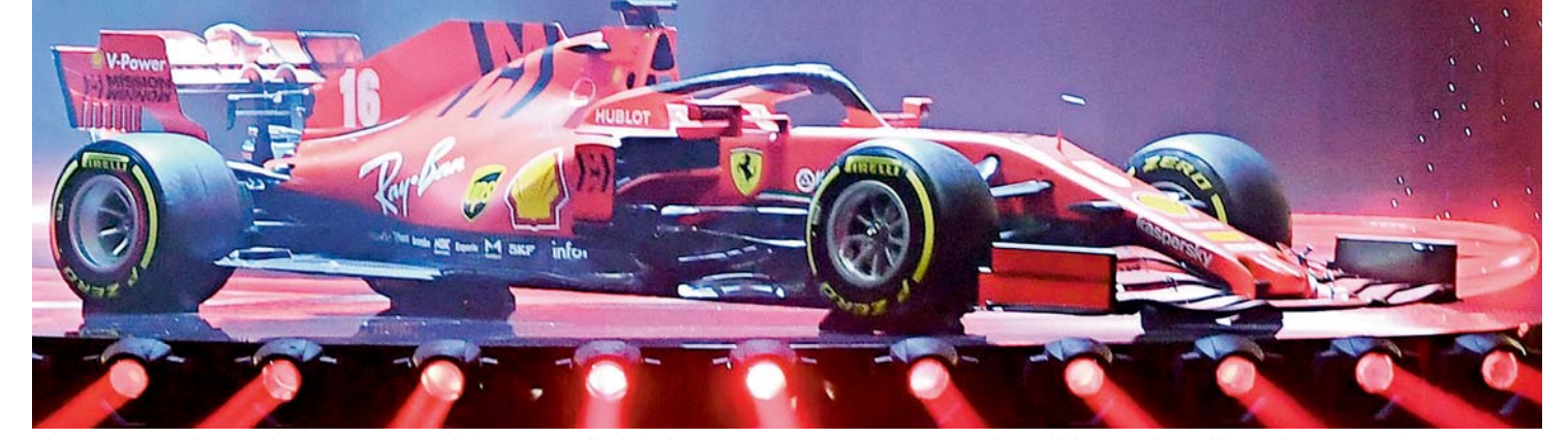
The new Ferrari Formula One SF1000 which was unveiled during a ceremony at Teatro Romolo-Valli in Reggio Emilia, Italy, on Tuesday.