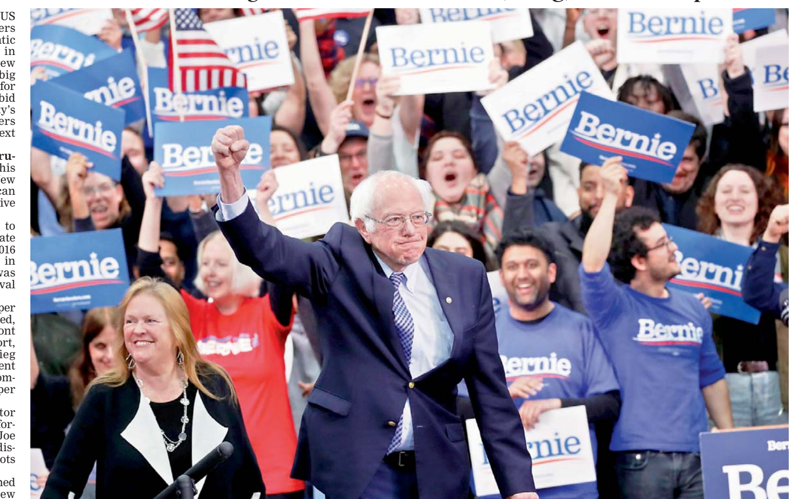
Democratic presidential candidate Senator Bernie Sanders at a primary election rally in Manchester, New Hampshire.