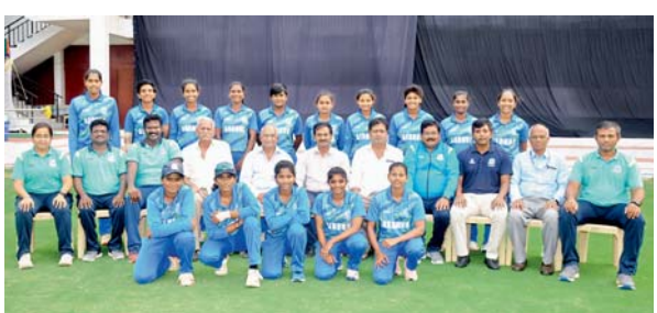
Members of the Andhra women's Under 23 team pose after winning the BCCI one-day tournament.

It could prove tricky with FIA organising a record-breaking 22 Grand Prix this season.