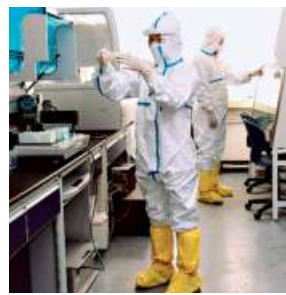
Laboratory technicians testing samples in Shenyang.

In Hubei province, in central China, officials said 242 people died on Wednesday, the biggest daily rise since