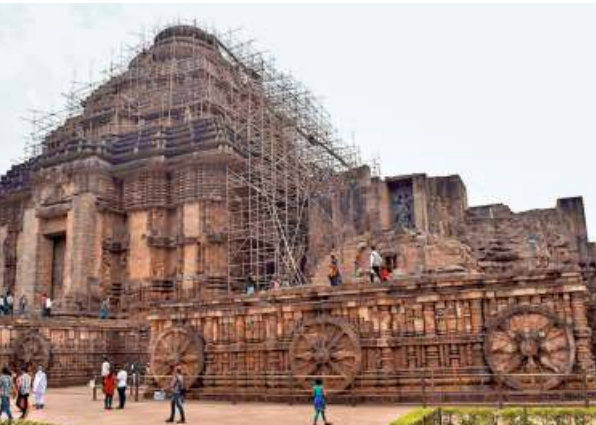
An ASI official said the scaffolding at the Sun temple in Konark would be taken down by the end of the month.

The official, however, added that the structure was found to be stable. The ASI was in the process of removing the